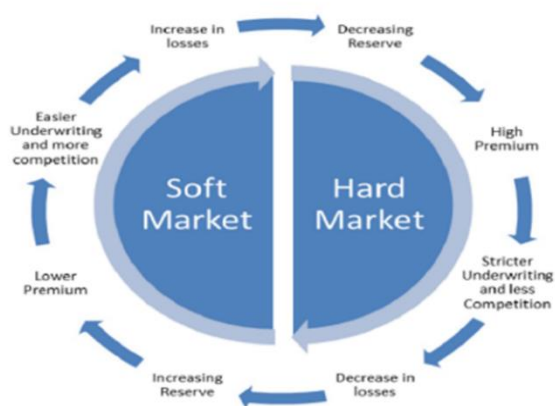
Figure 1. The underwriting cycle

Insurance markets are characterized by underwriting cycles – repeating, regular periods where insurance coverage is readily available at ‘reasonable’ prices (soft markets) and periods where prices are high, and coverage is limited or unavailable (hard markets) iv .