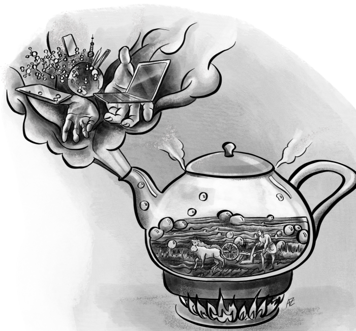
Figure 3: Phase Transition

Over the past two centuries, humankind has experienced a comparable phase transition. Much like the transformation of water in a kettle from liquid to gas, this shift marked the culmination of a process that had been steadily intensifying beneath the surface over hundreds of thousands of years of economic stagnation. While the transition from stagnation to growth may appear dramatic and sudden—and indeed it was—the underlying forces driving this change were set in motion at the dawn of humanity, gradually gathering momentum over the course of history. What, then, sparked this remarkable phase transition?