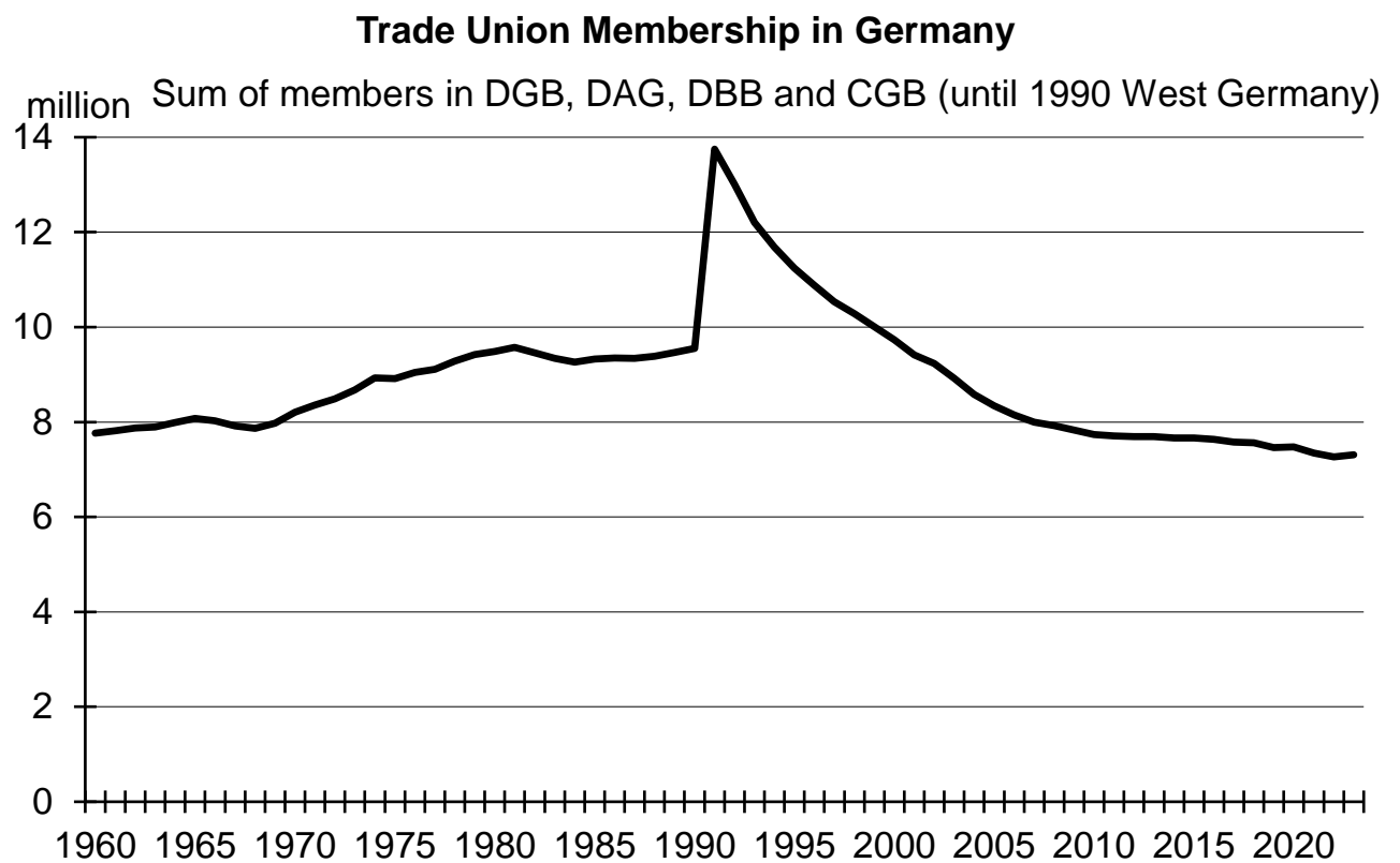
Figure 1: Trade union membership in Germany