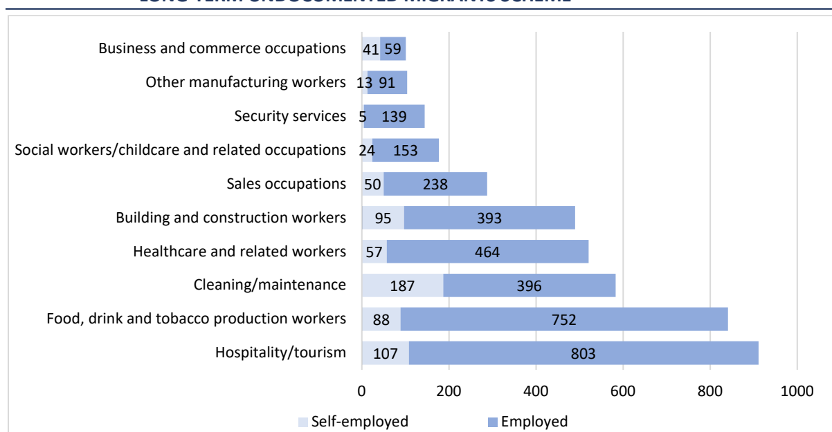
FIGURE 3.1 SECTORS OF EMPLOYMENT OF APPLICANTS FOR THE 2022 REGULARISATION OF LONG-TERM UNDOCUMENTED MIGRANTS SCHEME