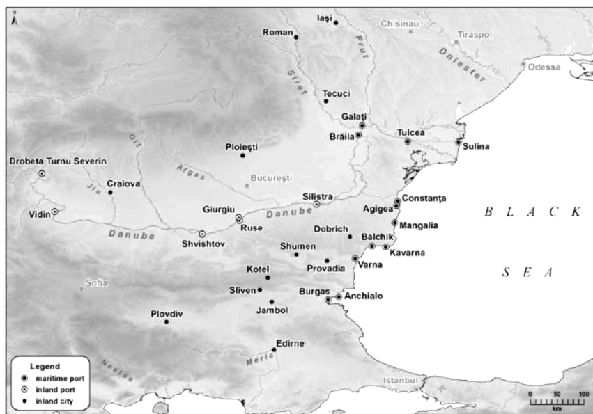
FIGURE 3 The main trading centres on the western Black Sea coast (19 th century)