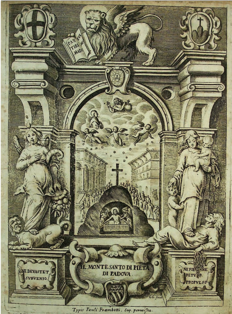
FIGURE 3 Frontispiece of Pietro Saviolo, Thesaurus urbis Paduanae (Padua 1682)

Copy held by the Archivio Generale Arcivescovile di Bologna (Reggio Emilia XVII 880).