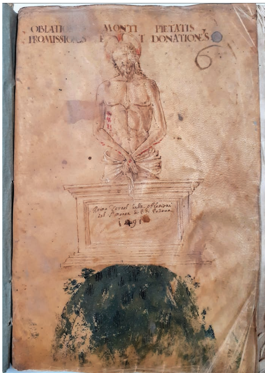
Parchment cover of the Primo zornal delle oblazioni (1491-1506), Padua, ASPd, Monte di Pietà, b. 18.