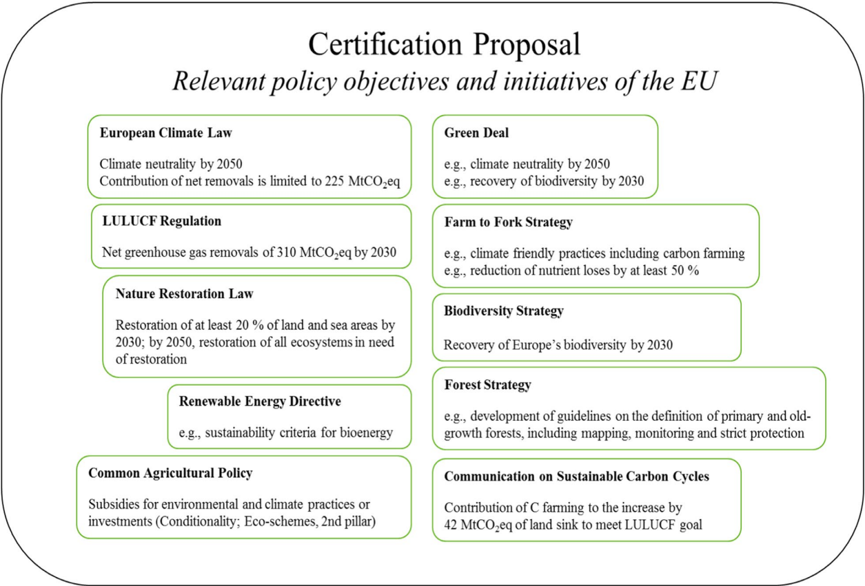
Fig. 2 Examples of policy objectives and initiatives that touch upon the CRCF

All carbon removals meeting the quality and verification criteria outlined in the Certification Proposal are eligible for certification (Article 3 CRCF). However, it should be noted that emissions falling under the scope of the EU ETS Directive 2003/87/EC are not included in the scope of the CRCF, as indicated in Article 1 para. 2 CRCF. One notable exemption from this exclusion is the storage of CO 2 from sustainable biomass that is zero-rated, i.e. carbon neutral in accordance with Annex IV EU ETS Directive. Besides procedural provisions, key elements of the proposed regulation include rules on carbon removal quality. The proposal establishes quality criteria and assigns responsibility for the certification schemes to the Commission to guarantee the quality of carbon removals and a robust and harmonised certification process. Concretely, Articles 4 to 7 CRCF lay down “QU.A.L.I.T.Y criteria” for quantification, additionality and baselines, long-term storage, and sustainability. Carbon removal activities have to provide a net carbon benefit, i.e. the carbon removals under the baseline minus the total carbon removal of the carbon removal activity minus the GHG