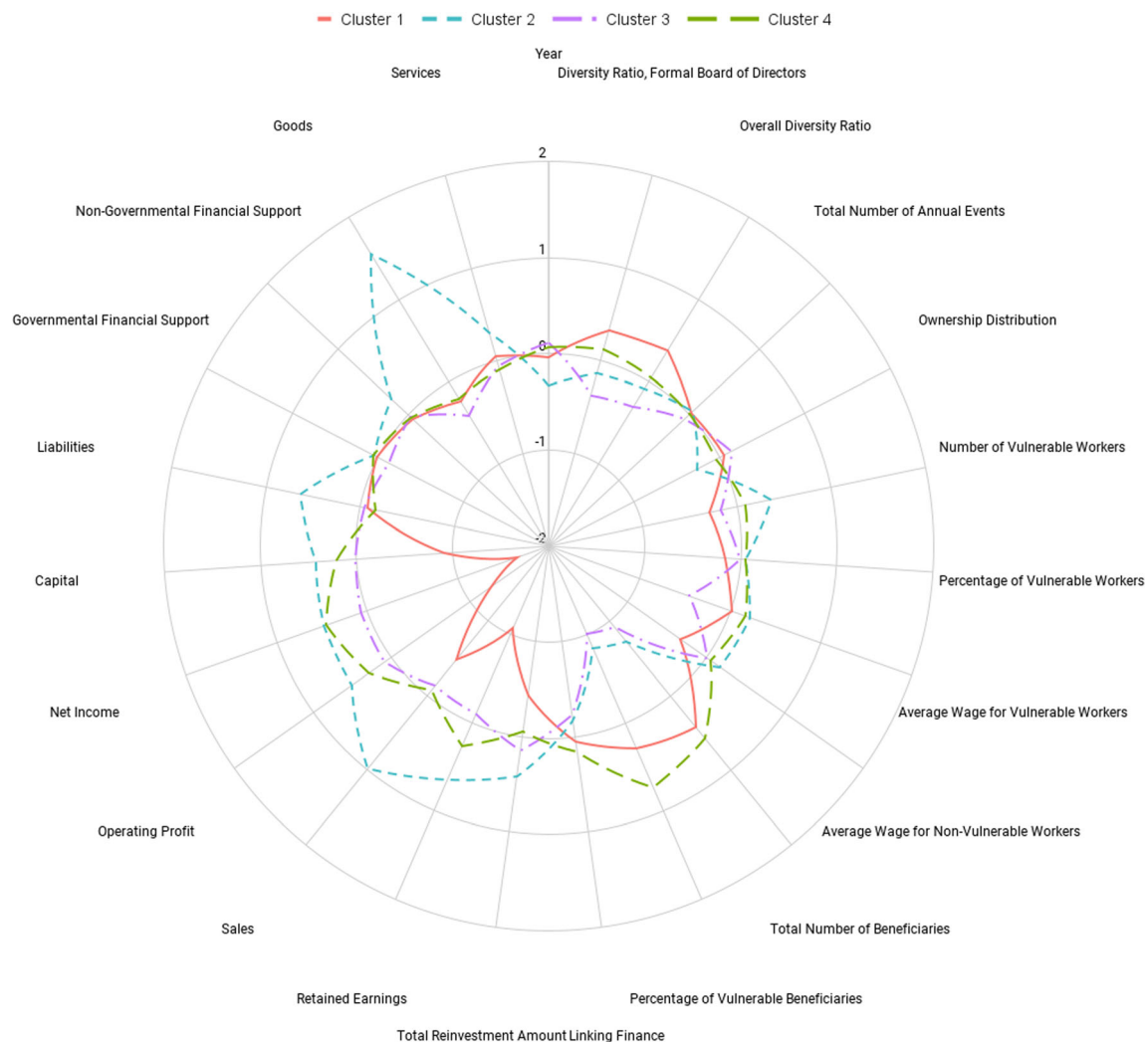
Fig. 1 Korean government-certified social enterprise cluster attributes

Thus far, there has been little explicit exploration of the semi-public sector hybrid SE subpopulations that have emerged as products of public sector entrepreneurship, which imbues this study with value as we provide empirical, population-level evidence of the diverse forms of GCSEs have assumed. We empirically demonstrate the types of SEs that may emerge in response to the state's