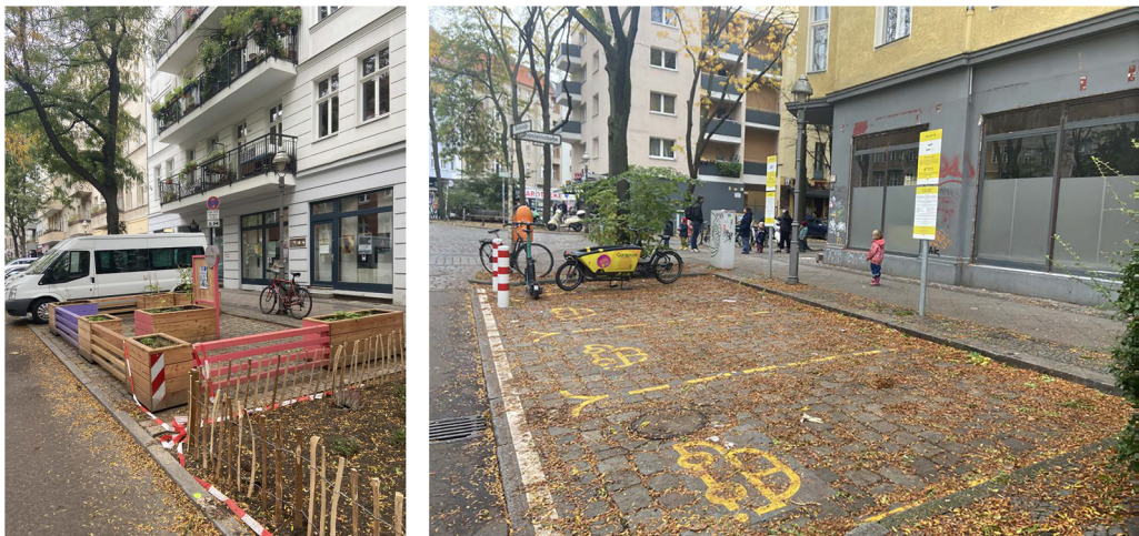
Figure 1. The street space reallocation.

to the district councillors’ assembly (BVV) (see Figure 2 ). Based on the findings, the municipality’s governing representatives positively evaluated the project. The implemented redesign measures are to remain in place unless the BVV decides to dismantle them.