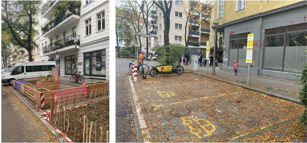
Figure 1. The street space reallocation.

to the district councillors' assembly (BVV) (see Figure 2). Based on the findings, the municipality's governing representatives positively evaluated the project. The implemented redesign measures are to remain in place unless the BVV decides to dismantle them.