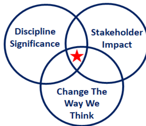
Figure 2. Mickey Mouse Diagram applied to the “So What” section

The tenth part provides the project’s bottom line, otherwise known as the “Contribution” section. This part includes the summary of the purpose of the research, which challenges the writer on how much they actually understand their own project. In this research pitch, once again, the “Mickey mouse” technique was employed to signify the three most important dimensions of contribution in the most concise way possible. First, this project aims to provide insights into the adoption process of blockchain technology as an institutional technology compared to general-purpose technology. Furthermore, a configuration framework helps introduce a blockchain adoption framework in which the most optimal combination of blockchain characteristics is chosen for each financial ecosystem’s typologies. Finally, the use of the fsQCA method is new within the technology adoption literature, so this research idea introduces yet another technique to this field of study.