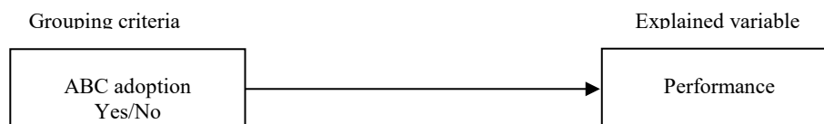
Figure 1. Impact of ABC on company performance

From the literature review, we propose the following hypothesis: Companies that adopt ABC are performed better than those that do not adopt it (cf. Figure 1).