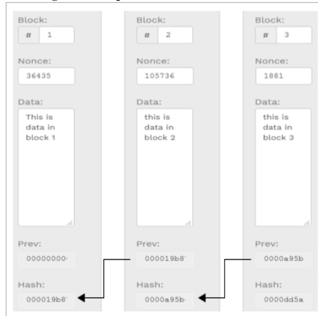
Figure 1. Simplified blockchain architecture