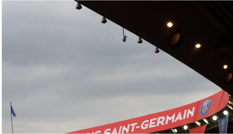
Image 1. Fans surveilled from above