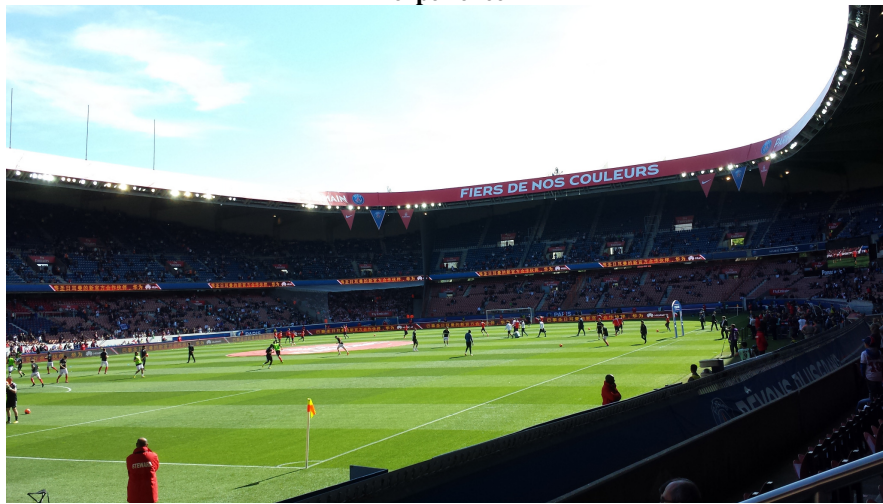
Image 3. A lack of banners and flags demonstrates the new sterility of the stadium experience

Beyond recording fan behavior (and indeed beyond the sole focus of PSG control), there was a bigger panopticon outside the stadium, where strict control of people authorized (or not) to buy tickets through a “blacklist” of fans existed. Those in that list were systematically denied entrance to the stadium. This regulation was approved by judges, which made this blacklist appear legitimate. There was also a second blacklist of “potential” problematic fans (about 2,000 of them at the time of our data collection) who regularly had their tickets cancelled by PSG one week before a given match or sometimes on match day. Moreover, PSG fans increasingly reported the feeling of being “ spied on social media ”. 17