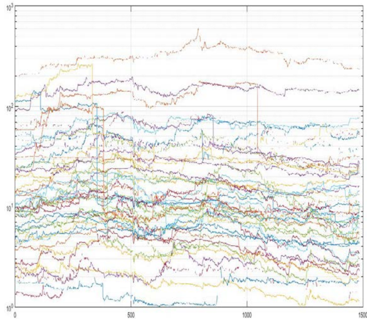
Figure 2. Evolution of the share prices (48 companies - 2009 to 2014): Logarithmic scale

A thorough analysis of the different curves reveals some aberrations in the collected data. Mainly, some curves look to be as dash line for given dates, which reflects quotation interruptions. For each of those particular cases, it was decided to duplicate the previous stock price value observed. Otherwise, ANN simulation tool would consider the missing values due to quotation interruptions as zero-valued, which would compromise the prediction quality.