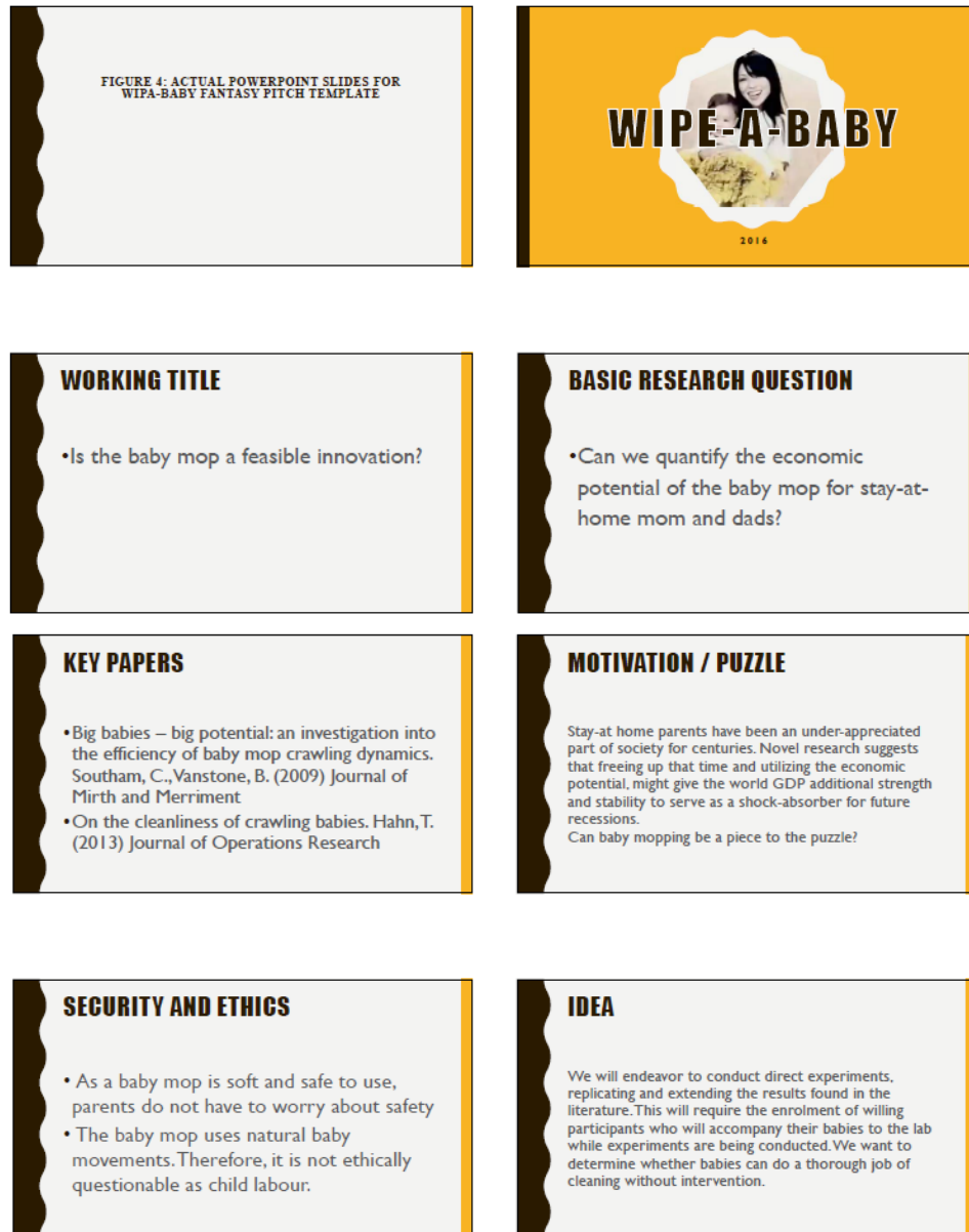
Figure 3: “Wipe-a-Baby” Pitch Slides