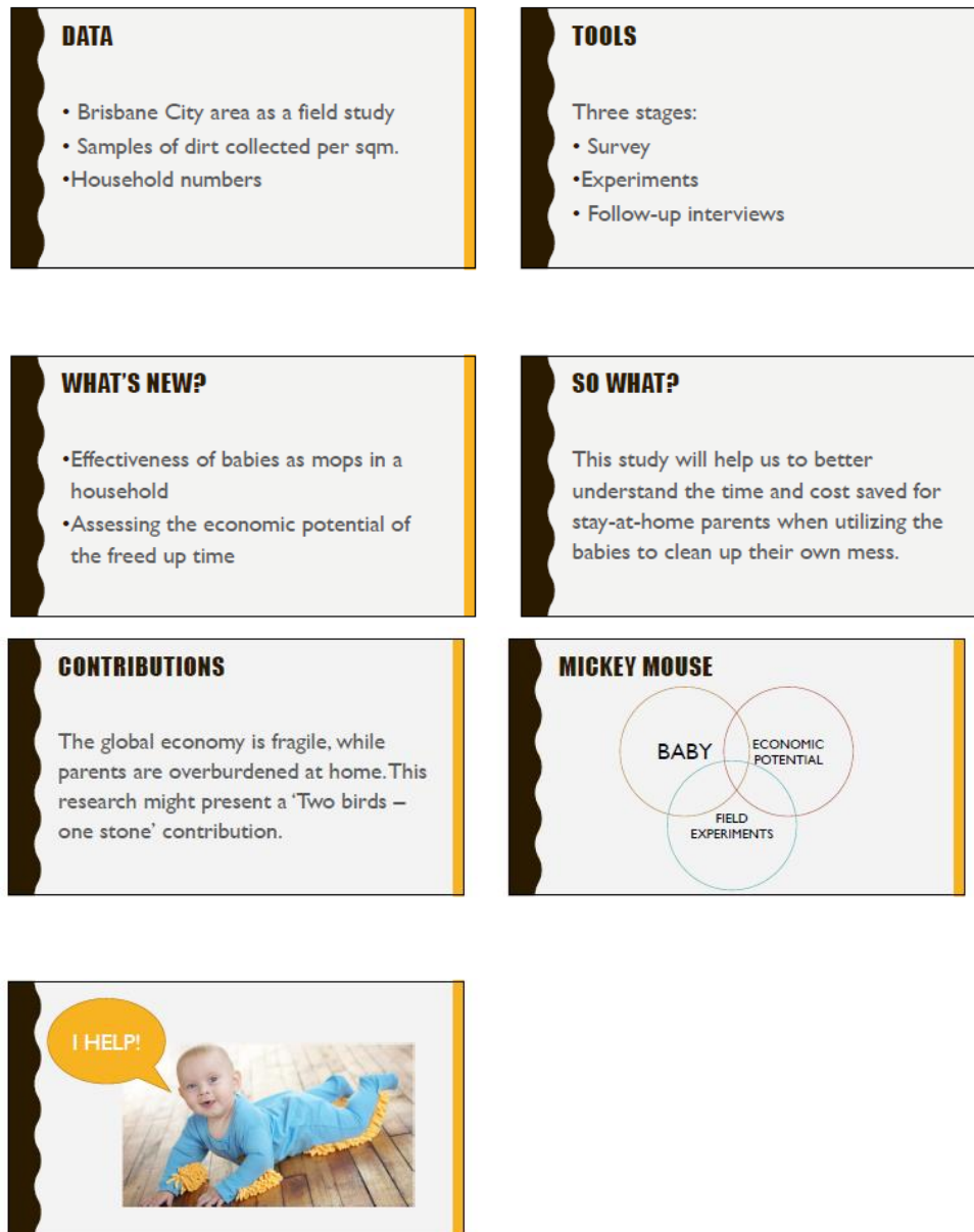
Figure 3: “Wipe-a-Baby” Pitch Slides (continued)