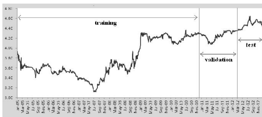
Figure 1. EUR/RON exchange rate evolution

Considering that an FX rate forecasting model would serve for future predictions, the splitting rule was based on the chronological dimension, meaning that the oldest 75% of the prices would fall into training set, the following 15% of the exchange rates would be included in the validation sample, and the most recent 10% would be part of the test dataset. The evolution of EUR/RON exchange rate and the splitting intervals are available in Figure 1.