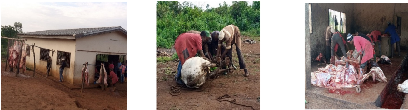
Figure 2. Slaughterhouse, slaughter and traditional treatment of carcasses in Ngaoundéré.

Traditional slaughterhouses are spaces with or without a covered room, located near unhealthy waterways where the slaughter by-products (viscera or marara) are emptied and cleaned. In these makeshift slaughterhouses, the animals are slaughtered, and the carcasses are cut up in the open air, on the ground, because the capacity of the slaughter room is typically insufficient (Figure 2).