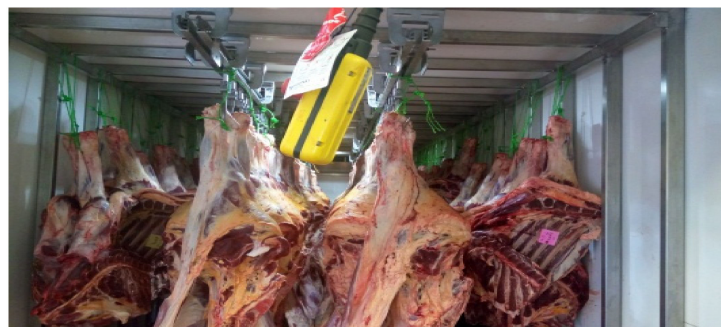
Figure 5. Modern transport of carcasses from the slaughterhouse to meat distribution points.

In addition, after post-mortem inspection, the healthy carcasses are marked with a green stamp and re-dried in cold rooms. After this maturation stage, which lasts about 48 h, the carcasses and other slaughter products are delivered to customers by refrigerated means of transport (lorries, vans or trucks) (Figure 5).