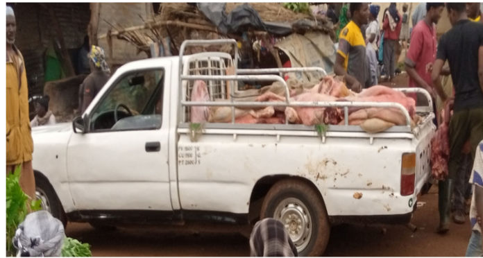
Figure 3. Traditional transport of carcasses from slaughterhouses to meat distribution points.