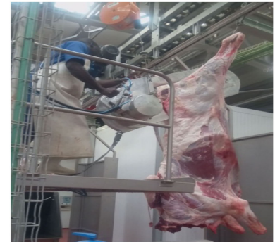
Figure 4. Modern slaughterhouse, slaughter and carcass processing in Ngaoundéré.

In addition, after post-mortem inspection, the healthy carcasses are marked with a green stamp and re-dried in cold rooms. After this maturation stage, which lasts about 48 h, the carcasses and other slaughter products are delivered to customers by refrigerated means of transport (lorries, vans or trucks) (Figure 5).