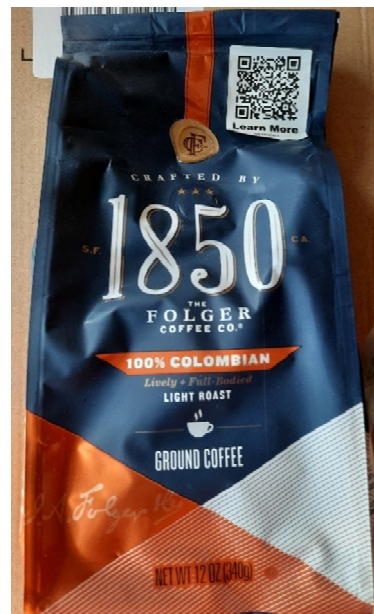
Figure 2. The product delivered to the United Kingdom.