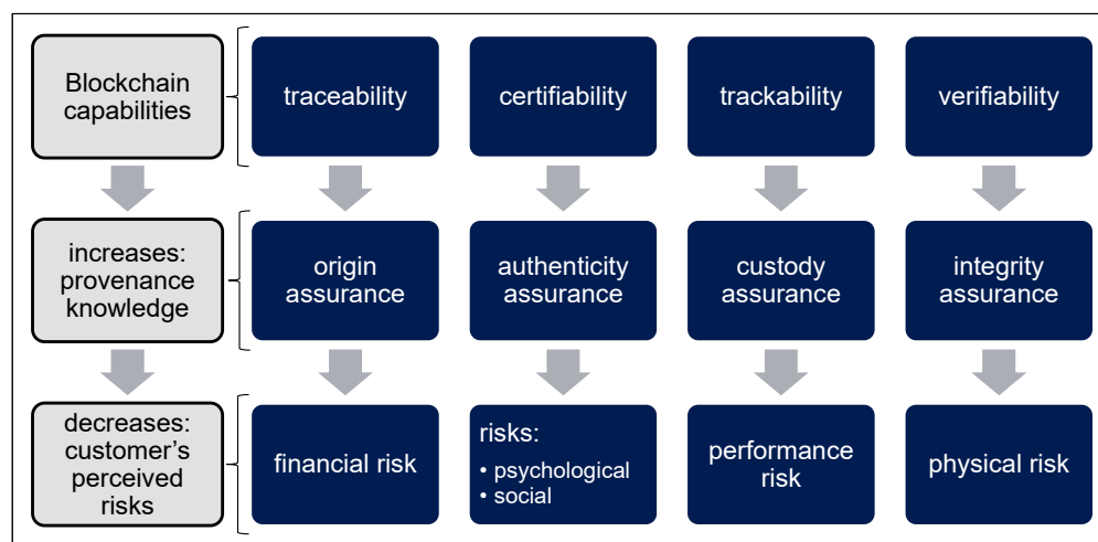
Figure 1. Impacts of Blockchain-activated origin knowledge on the customer [12].

the BC solution can only be as secure as the link between the physical products and the BC [13] (p. 42).