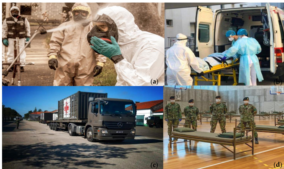
Figure 2. Combat service support in response to COVID-19 crisis (Adapted from HFAR [26] and the PRT Army [27]): (a) Decontamination team; (b) Hospitalization support; (c) Emergency Military Support Module; (d) Increased inpatient capacity.

In the military sciences, there is a clear distinction between logistics and military operations. Albeit the distinction of these concepts during the COVID-19 crisis was somewhat blurred, this is because the relationship between the delivery of supplies to civil institutions is often linked to the provision of services [25]; that is, the delivery of a product entails the provision of a service, especially in situations that require great technicality, as will be seen below. Thus, due to the inability of civilian agents (e.g., National Healthcare System or National Authority for Emergency and Civil Protection) to respond in a timely manner, either because of the high number of requests from the civilian population, or because of the high technicality that the fight against COVID-19 demanded in the first phase, the Portuguese Armed Forces were invited to work beyond the strict framework of logistical support. In other words, as the Armed Forces progressively incorporated operational missions of direct support to the civil society (Figure 2).