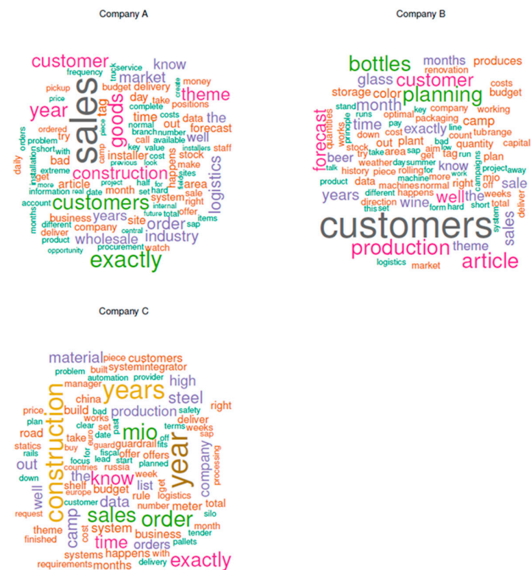
Figure 1. Word clouds for companies A, B, and C.

Word clouds are a straightforward yet popular tool to visually represent textual data, and their interpretation is straightforward: the bigger a word, the more often it is mentioned throughout the interviews. In our case, it gave the companies a rough idea about the most important topics that emerged during the interviews. Word clouds therefore provide an ideal starting point for further discussions. For instance, the relative size of the words (topics) can be used to critically assess the importance of the respective topic within an organization. Additionally, it is also possible to discover “missing” topics. Figure 1 illustrates which topics are of importance for the respective companies in our sample. Companies A and B seemingly have a strong marketing focus (as is shown by terms such as “customer” or “sales”), while company C concentrates on production and project management (“construction,” “year”).