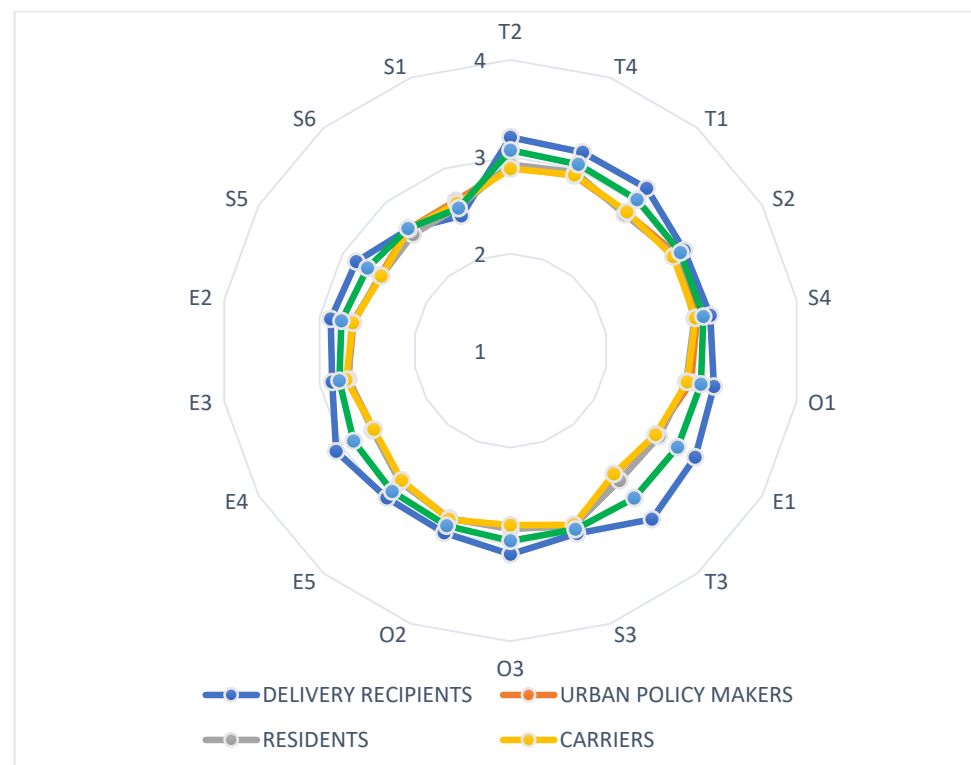
Figure 2. Average assessment of the relevance of the criteria according to all stakeholders.

is, make the transition to environmentally friendly operations. Residents, as expected, highlighted the criteria from the social group as the most relevant, and the criterion of greenhouse gas emissions particularly stands out. They also assessed the organizational criteria group as more relevant, especially the possibility of access to delivery point. Surprisingly, they evaluated the safety criterion as the least relevant. Urban policy makers are the drivers of decision-making and the creators of sustainability policies related to the city center. As expected, urban policy makers rated the criteria from the social group as the most relevant. They assessed the technical-technological criteria group as very relevant; unloading/loading equipment and condition and quality of infrastructure stand out.