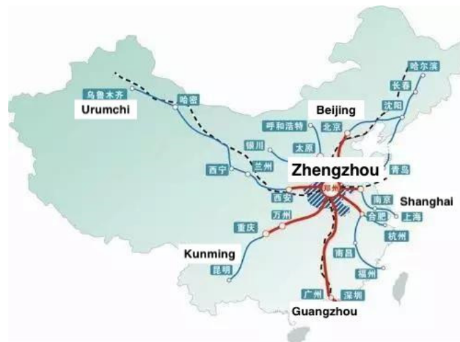
Figure 2. Railways of Zhengzhou. Reprinted from Zhengzhou Airport Economy Zone.