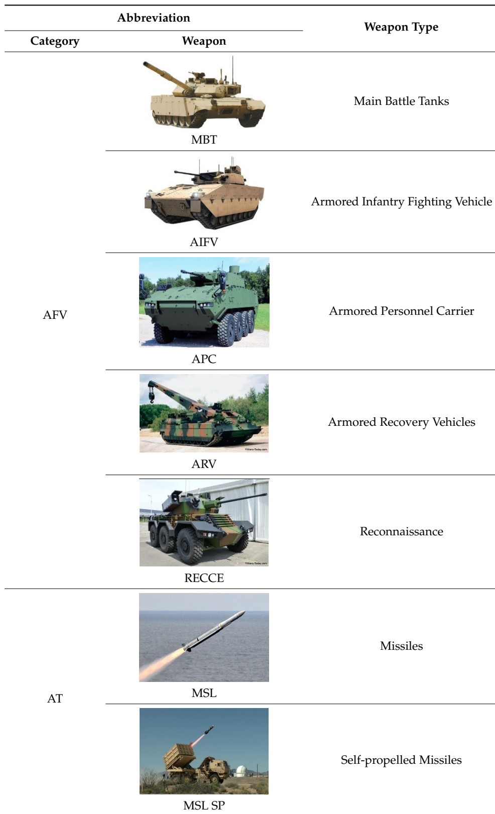
Table 1. Weapon types and abbreviations. Armoured Fighting Vehicle; Anti-Tank, Artillery.