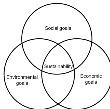
Figure 1. Triple bottom line (TBL) goal system.

TBL sustainability has three major areas, which may be conflicting at times: economic development, environmental performance, and social gains [13]. As is shown in Figure 1, those three areas partially overlap and it is only the coordinated interplay of all three that finally leads to sustainability. In logistics and SCM research, this framework has been successfully applied, for example, to analyze the effect of the sustainable supply chain design of social businesses [12], to show that sustainable supplier co-operation has positive effects on firm performance across all three dimensions [14], and to find viable paths for integrating the social dimension with general sustainable SCM theory and practice [15]. Given its inclusive nature, TBL sustainability provides the ideal target system for a comprehensive logistics and SCM framework. Additionally, substantial literature exists on how TBL reporting can be implemented and how widespread it is among companies [16]. It is noteworthy that the distinction between strong and weak sustainability, the latter of which assumes that a substitution of natural capital by man-made capital is sustainable [17], is beyond the focus of this paper.