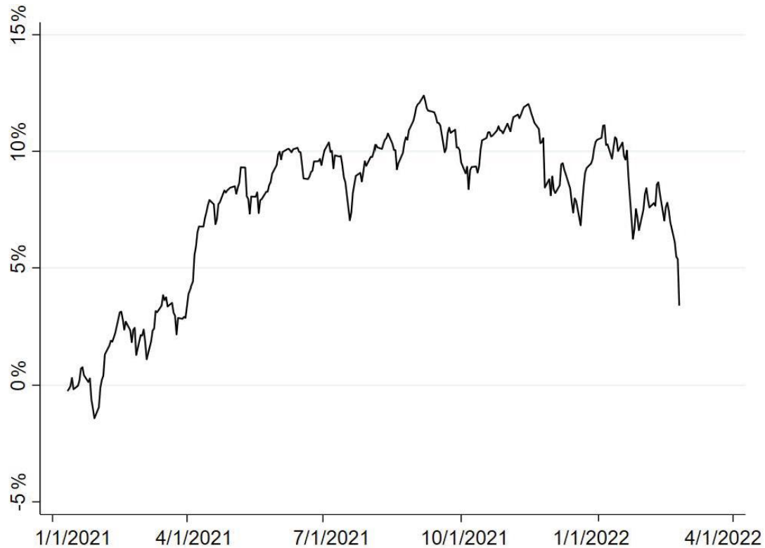
Fig 1. Cumulative average daily returns.

Figure 2 shows the overall vaccine doses administered in the UK, including both initial and booster shots. The figure reveals two major surges in the total vaccination count. The first surge corresponds to the initial rollout of the vaccine, while the second one is observed in January 2021. Examining the individual curves for initial and booster vaccinations, it becomes clear that the first upswing is driven by the administration of initial doses. The second surge can largely be attributed to the increased administration of booster shots, as the number of initial doses began to plateau from July 2021 onwards.