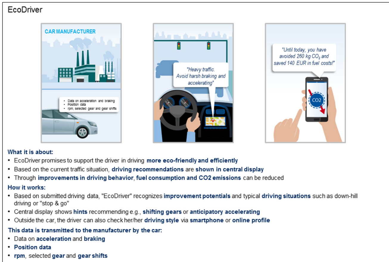
Fig. 2 Example for stimulus material used in survey

Appendix 16. We concluded that multicollinearity should not be an issue for our study variables, as no bivariate correlation between main constructs exceeded 0.5 (correlation between Perceived Privacy Risk and Car-Data-related Risks ) respectively -0.68 for control variables (correlation between Low Mileage and Regular Access to Car ). Variance Inflation Factors (VIFs) were just slightly above 1 for all main constructs and not higher than just above 2 for control variables indicating little multicollinearity issues in our data.