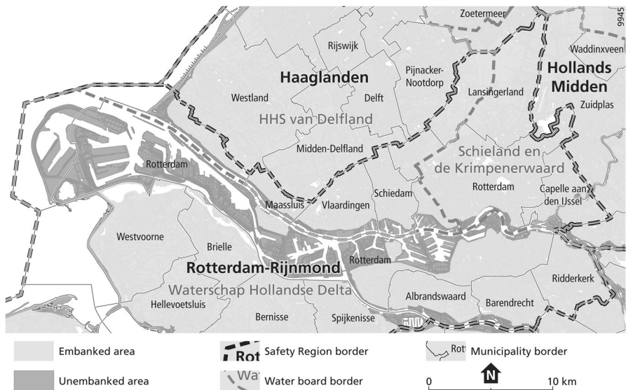
Fig. 1 Rotterdam–Rijnmond region.