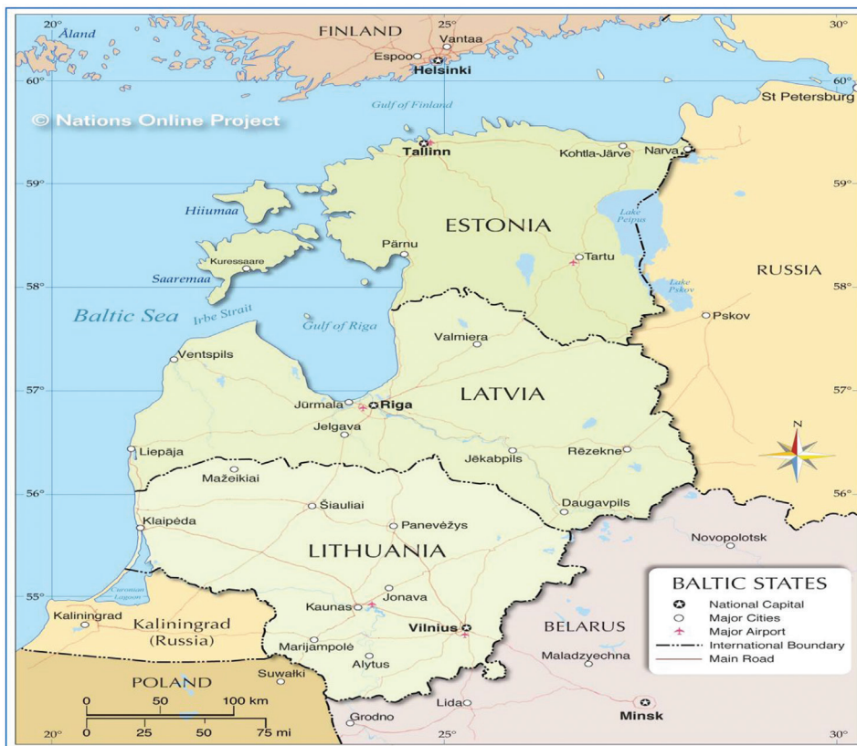
Figure 2. Major ports of Baltic States.

Ports' facilities to attract Asian cargoes are considered from two points of view: its geographical location and logistical capacities. According to these criteria, three Baltic Sea ports (Figure 2) can compete for large-scale traffic flows from Asia.