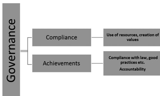
Figure 1. Framework of the governance IFAC.