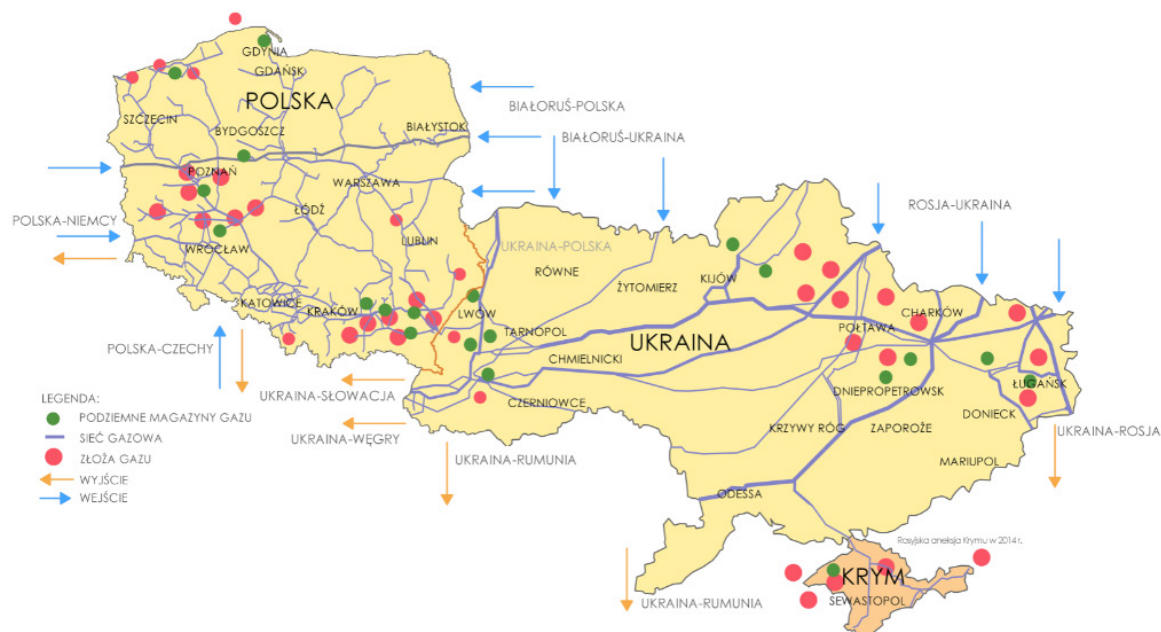
Fig. 1. Poland and Ukraine with transfer infrastructure, underground gas storage (UGS) facilities and earth gas reservoirs.

Considering geographical aspects, the area of Ukraine (603628 sq. km) is almost twice as large as the area of Poland (312679 sq. km). Ukraine is situated between the EU (Poland is the western neighbor) and the Russian Federation, with access to the Black Sea and the Sea of Azov. According to the statistical data, in 2017, the population of Ukraine was 42 million [Ukrastat, 2018], while Poland was inhabited by 38 million people [Demografia, 2018]. The population density determined on the basis of the obtained data is 123 persons per sq. km in Poland and 75 persons per sq. km in Ukraine.