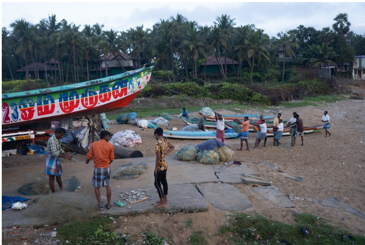
Figure 3: Fishers relocate their gear to coastal space with wider beaches