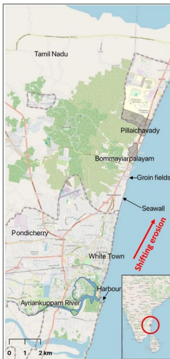
Figure 1: Case study area