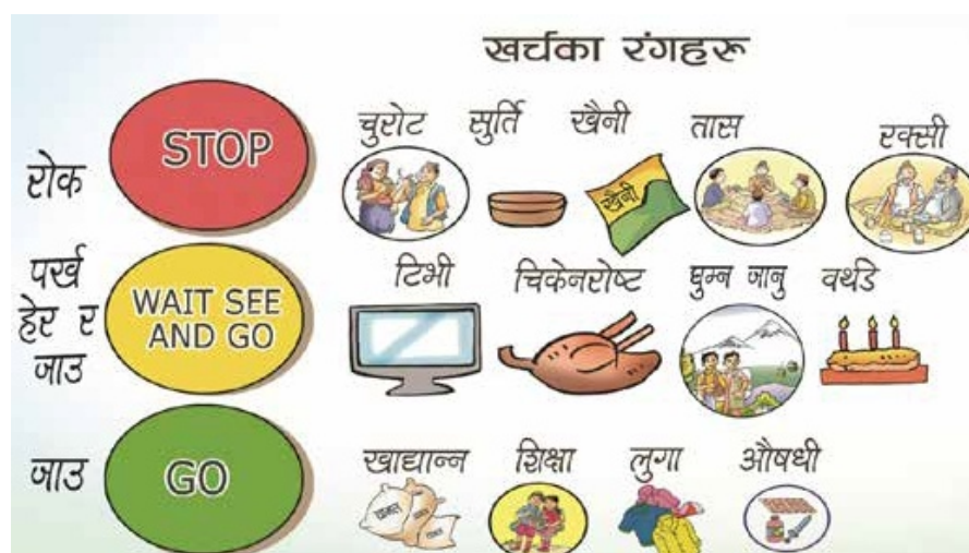
Figure 1. Traffic lights classifying desirable, cautiously desirable, and undesirable expenses.

Finally, FOR-FLE pedagogy attaches hope to insurance products. As a risk-management tool, insurance is promoted to overcome fear of emergencies, to climb the ‘ladder of wealth’, and to realize the promise of happiness. Insurance products are placed at an advanced stage of the ladder. Once you have reached the level of being able to manage future uncertainties through anticipatory risk management technology, you are supposed to be financially disciplined, hence, achieve happiness (SAMI, 2017; SAMRIDDHI, 2020a; Simkhada and Adhikari, 2015). Yet, to get there, transnational families need to curtail their desire to consume and instead adopt a frugal lifestyle in the present. The emotional regime of FOR-FLE establishes a ‘scale of desirability’ through which family expenses are classified into wants, needs and prohibitions, using a traffic light system (see Figure 1). This scale creates a hierarchy of expenses, promoting certain consumption and investments practices (Simkhada and Adhikari, 2015: 37). Through this scale of desirability, the emotional regime of FOR-FLE associates hope with saving and investments, and guilt and shame with consumer spending. This constructs the subject of the “irresponsible consumer” (Arthur, 2018: 446) who is not sufficiently frugal, does not engage in financial planning, and neither saves nor invests. By doing so, it nudges people to “consume responsibly” and adopt prescribed financial behavior in order to realize happiness and prosperity.