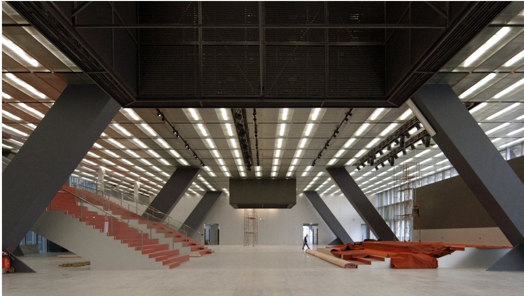
Figure 3. Zachary Formwalt, In Light of the Arc , 2013. Video still.

Formwalt's projects question the extent to which historical images and photography can capture the virtual flows of capital, which often remain invisible. While he reveals the "entanglements of history, capitalism and image making", the series of video installations in the exhibition also underscores that the financial processes underlying these exchanges cannot be fully exposed and "remain elusive" (Bouwhuis, 2014: Paragraph 3). Formwalt's project suggests that the 'invisible' exchanges of virtualized capital and its increasing abstraction are in inverse relation to their impact on the everyday lives of individuals and communities. That is, the extensive virtualized trading of global capital, which now increasingly occurs through digital algorithms, has created more wealth for the few at the expense of the many. These consequences are manifest, not in the architecture and urban image of the stock exchange itself, but in the physical consequences of debt. Thus, Formwalt comments that he is "interested in the mechanics of that space; the way abstraction is at work there. And of trying to forge some connections between that imaginary realm of capital flow and the real consequences it tends to obscure" (quoted in Vesters, 2015: Paragraph 15).