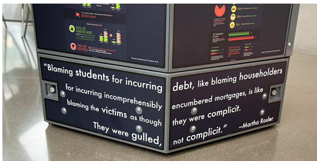
Figure 2. Martha Rosler, Coin Vortex for Student Debt , 2014.

The text on the base of the installation reads: “Blaming students for incurring debt, like blaming householders for incurring incomprehensibly encumbered mortgages, is like blaming the victims as though they were complicit. They were gulled, not complicit”.