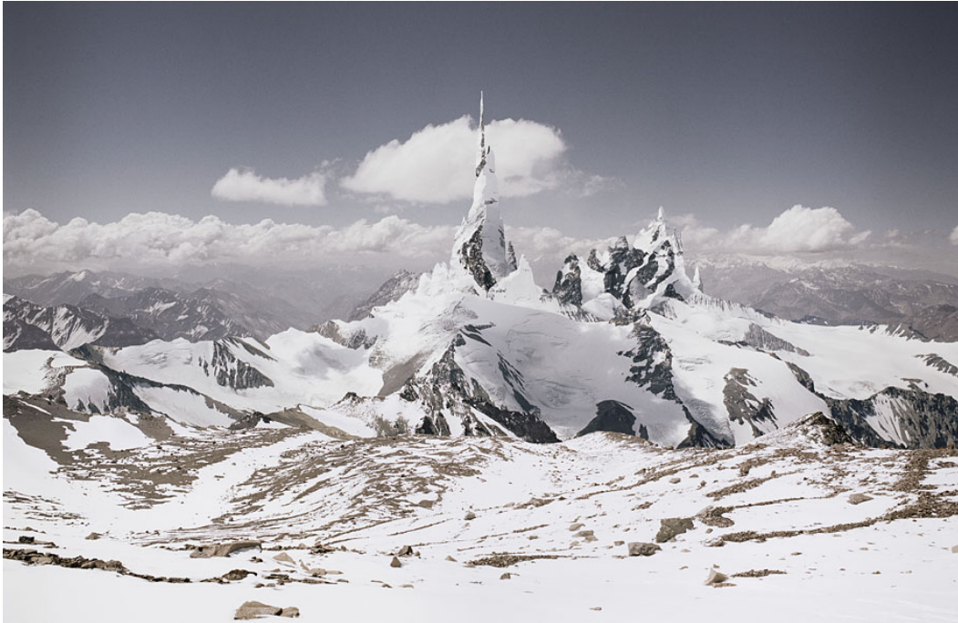
Figure 4. Michael Najjar©, nasdaq_80-09 . Courtesy of the artist. < http://www.michaelnajjar.com/ >

In High Altitude , Najjar also references the eroding boundaries between reality and simulation when he observes: “If the focus used to be on the exchange of goods and commodities, it is now securely on the exchange of immaterial information” (quoted in Anti-Utopias , 2010: Paragraph 4). The images in High Altitude , like works such as The Lost Horizon by artists Mathew Cornford and David Cross, appropriate the metaphors of mountain landscapes to destabilize the promotional signification of the financial industry. As Alistair Robinson (2014: 139) observes: “Each rise and fall is represented as part of a landscape that pushes and pulls at the earth, with market movements becoming monstrous forces being unleashed from under the earth’s crust”.