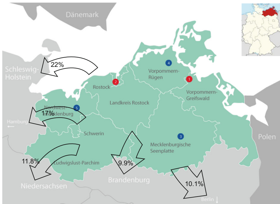
Fig. 1 Out-commuting flows from MV to other federal states (main destinations)