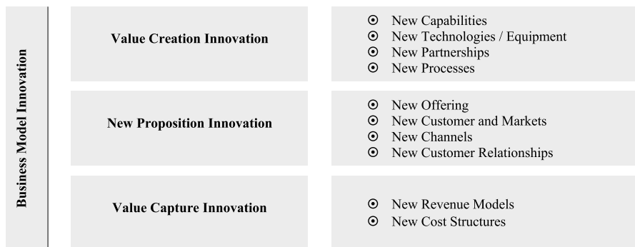
Fig. 1 BMI Categorization (own illustration following Kraus et al. (2022b))

The model delineates three categories of BMI. First, in terms of “value creation innovation” technological advancements play a pivotal role in driving BMI (Clauss 2017). Companies striving to gain a competitive edge must continuously innovate through the adoption of new technologies or processes (Needleman et al. 2021). This necessitates the acquisition of expert knowledge of the new technology and its broader context (Desai et al. 2014). Regarding AI, companies must be adept at integrating technical innovations into an existing landscape. Second, “new proposition innovation” of BMI is driven by the emergence of new markets and sales channels, requiring organizations to adapt their internal and external communication processes (Needleman et al. 2021). The introduction of new products and services through BMI necessitates changes to the existing strategy of a company, which entails modifying both the technical implementations and process structures simultaneously. Last, the expansion of revenues is a significant driver of BMI in “value