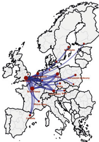
Panel A: Europe