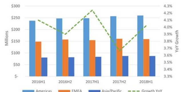
b) Global Regional Services Revenue (First Half of 2018, in USD bln) and Year-Over-Year Growth (in %).