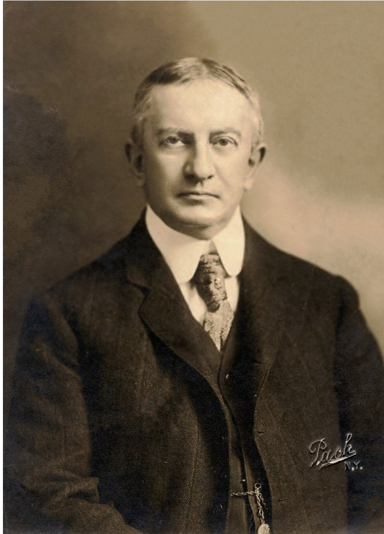
FIGURE 2: Charles Arthur Conant, 1890s.