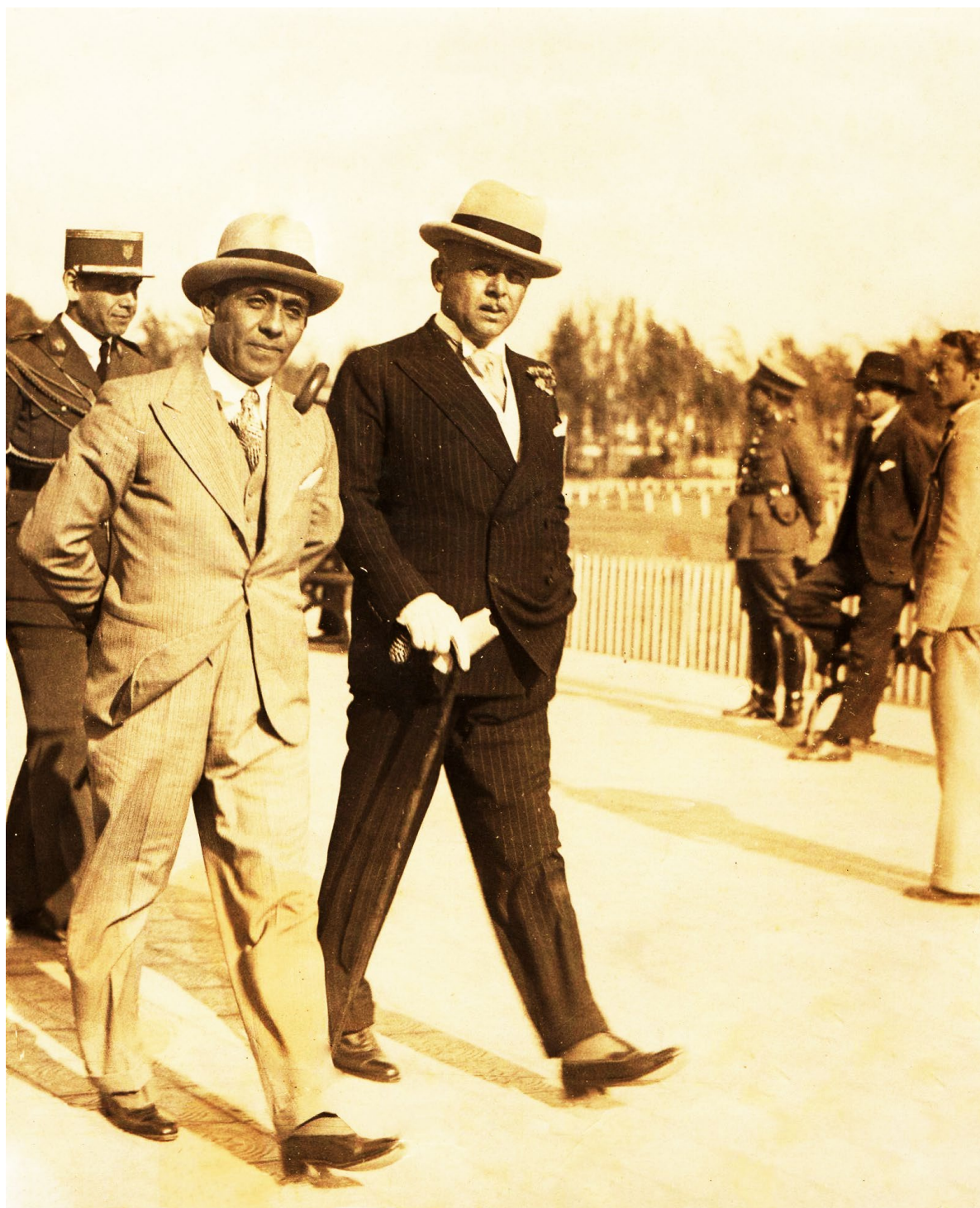
FIGURE 1: Edwin Kemmerer (right) continuing the work of building the dollar system with President of the Peruvian Provisional Government Junta Luis Miguel Sánchez Cerro, 1931.

Centro de Estudios Histórico Militares del Perú.