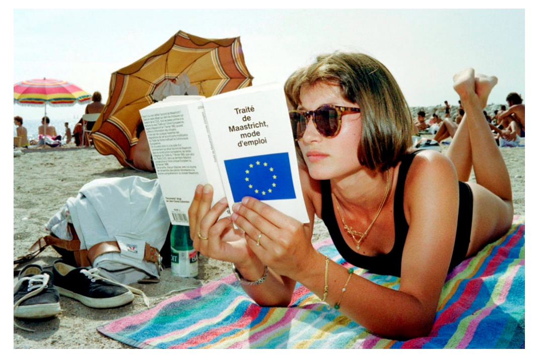
Figure 1: French-speaking student reading the Maastricht Treaty on the beach

First, the post-sovereign model did not in fact receive widespread popular approval. The Maastricht Treaty itself had only limited popular legitimacy, with a rejection in Denmark, <sup>14</sup> a narrow "yes" in France <sup>15</sup> and a hard-fought parliamentary ratification in the United Kingdom. <sup>16</sup> In 1993, the German Federal Constitutional Court ruled that there existed no European demos at that time (2 BvR 2134/92, 2 BvR 2159/92). The attempt to create one via the Constitutional Treaty of 2005 failed: clear majorities in France and the Netherlands rejected the proposed European Constitution.<sup>17</sup> With the Brexit referendum, finally, the British electorate voted to leave the Maastricht-EU, despite the foreseeable