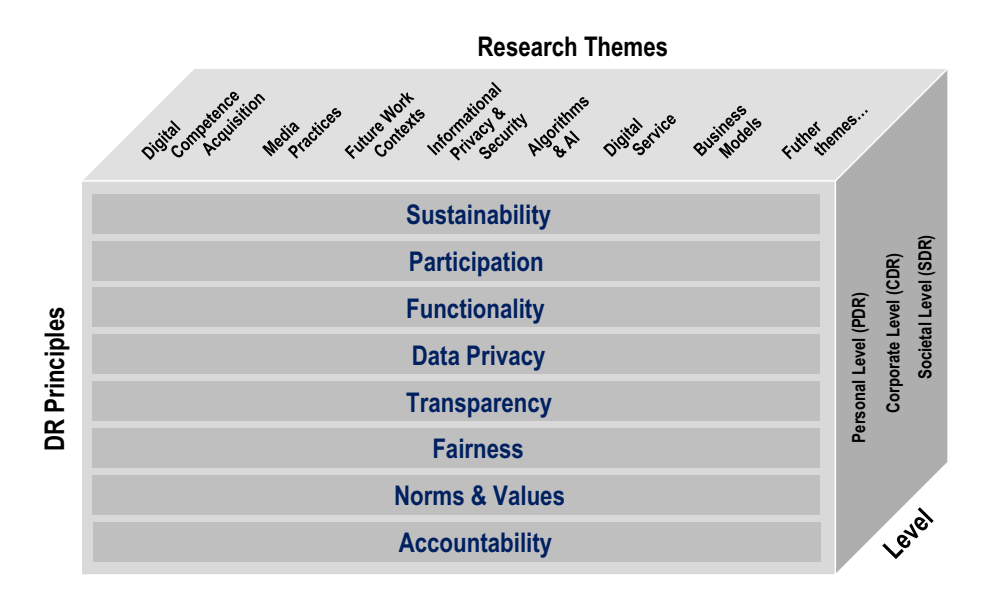
Fig. 1 DR Cube – A framework of DR principles, research themes and levels of stakeholders

have addressed various DR principles. In particular research on informational privacy has a long-standing tradition that grounds in the values and norms principle, directly concentrates on the privacy principle and relates to regulated functionality or increased participation. Other principles such as transparency has recently gained impressive momentum in the context of research on explainable algorithms and AI. We also note that certain principles bridge multiple research themes. For example, the principle of responsible participation offers a link for research on media practices, competence acquisition, digital work and services. This demonstrates the need for a broader conceptual understanding of the participation principle as a fundamental part of media-based involvement of users in novel services. We also noted that the theme of digital service has untapped potential for a more comprehensive analysis of the influence of DR, as the various research calls suggests. In sum, we can state that the IS field contributes in important ways to our understanding of responsible digital transformation. Our analysis of research themes suggests that the concept of DR helps to bring together important current research efforts under one umbrella while pointing out several useful interrelations across themes.