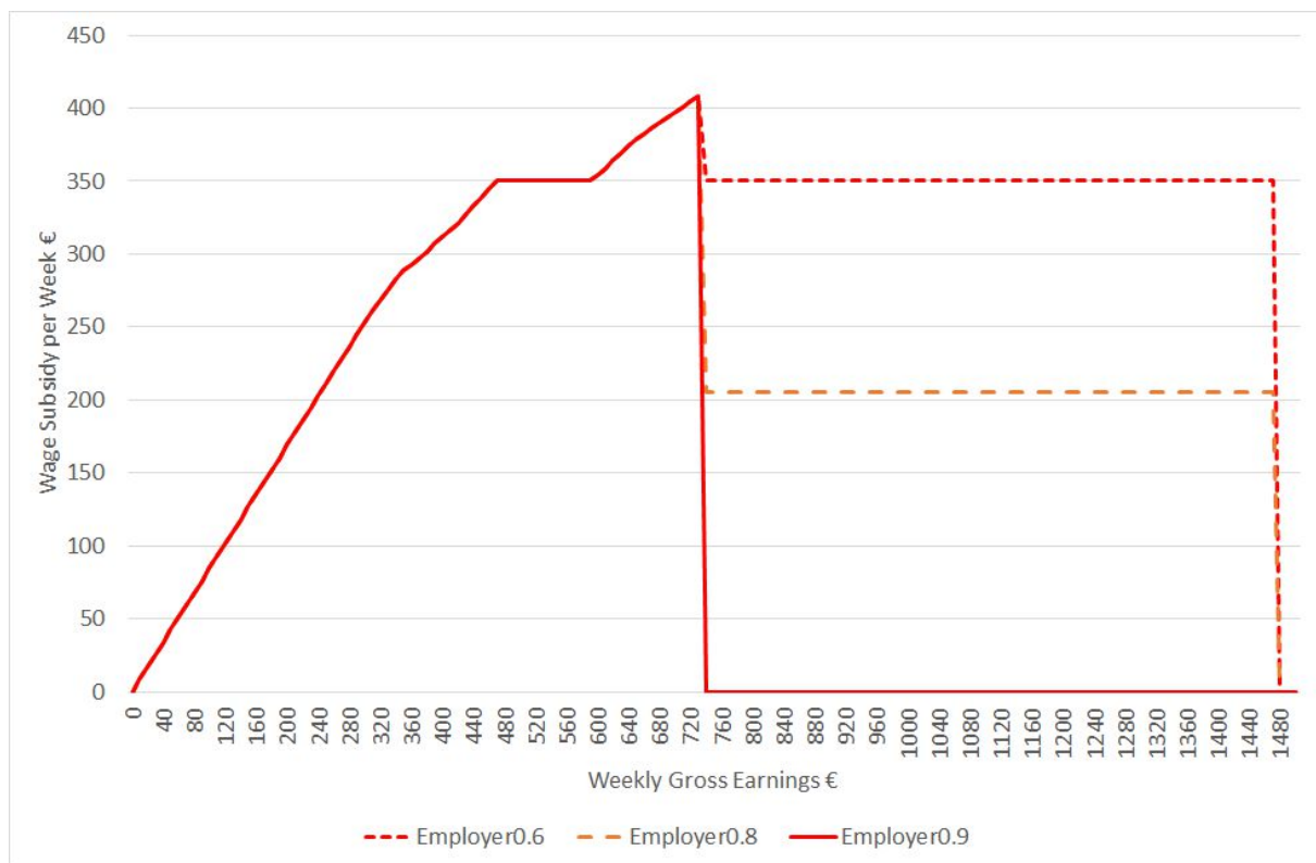
Figure C.2 Wage subsidy calculation