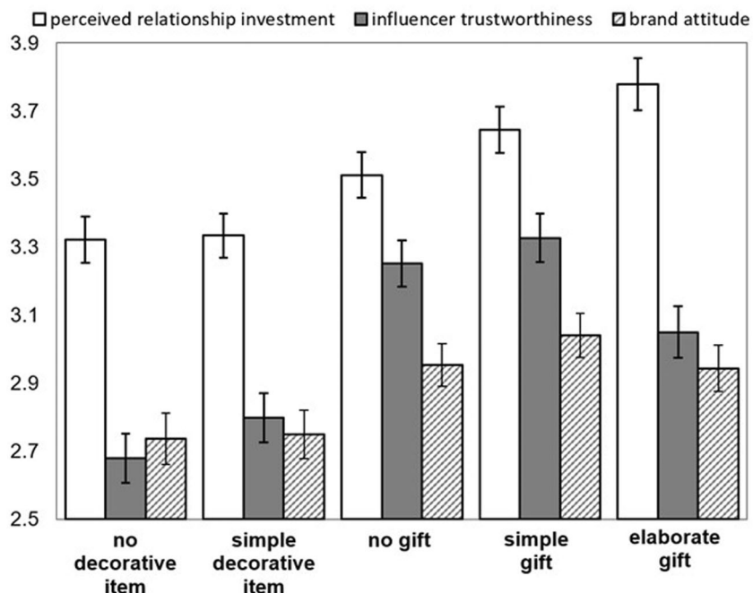
FIGURE 3 Mean comparison perceptions, Study 1. The error bars signal the standard errors above and below the mean values.