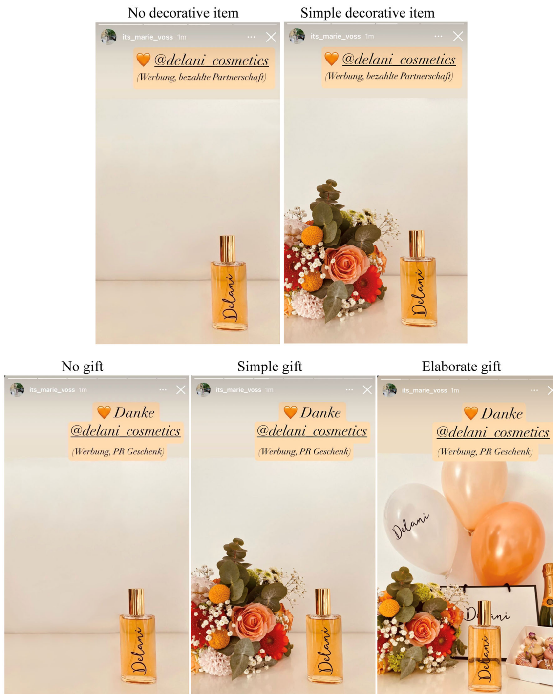
FIGURE 2 Experimental Instagram stories (screenshots). The German text on the screenshots reads for paid influencer marketing: "[orange heart emoji] @delani_cosmetics (advertisement, paid partnership)" and for influencer gifting: "[orange heart emoji] Thank you @delani_cosmetics (advertisement, PR gift)."

investment demonstrated significant positive correlation with influencer trust ( B = 0.10 , p = 0.016 ) and particularly brand attitude ( B = 0.27 , p < 0.001 ), resulting in a significant indirect effects of gifts, through perceived relationship investment, on influencer trustworthiness ( B = 0.03 , SE = 0.02 , 95% confidence interval [CI]