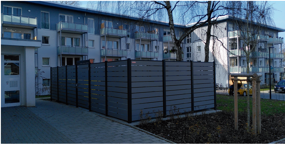
FIGURE 4 Newly refurbished buildings in Sandkrug

had left, and this was later confirmed in a group interview on 14 February 2023: ‘Many old people lived here. Some have died, some had to move away’. According to the tenants of several buildings, interviewed both before and after the retrofitting was completed (September 2021; June 2022; March 2023), several older people had moved out, particularly those receiving transfer payments. This was highlighted by one tenant who had lived in her building for 20 years: ‘The Bürgergeld 4 recipients are all gone’ (7 March 2023a). Another tenant who had lived in the neighborhood for 12 years knew several pensioners who worried that ‘if rents continue to rise, we cannot afford them anymore’ (7 March 2023f). Although the current tenants now needed less heating, no savings had materialized yet due to rising energy costs since 2022 and high back payments from the previous year, as expressed by residents in February 2023. This led to a considerable additional financial burden, creating the impression that: ‘Living here has become very expensive’ (14 February 2023a). Particularly striking was the fact that most of the tenants interviewed were unaware of the staggered rent increases continuing for the next four years.