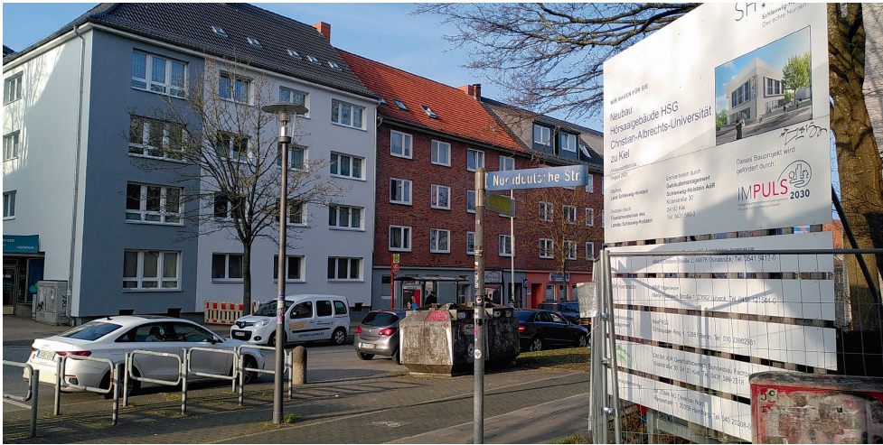
FIGURE 5 A construction sign informs about the expansion of the university's faculty of engineering; in the background a refurbished building stands next to an unrefurbished one (photo by Sören Weißermel, February 2023)

significant extension of the university's faculty of engineering and the planned light rail connection, as well as a tightening housing market with rents rising disproportionately and increasing land values (see the earlier section contextualizing the retrofitting in Kiel-Gaarden). An examination of current advertisements for apartments to rent showed that rents for new lettings had already reached the level of the citywide average, which had also risen sharply in recent years. This confirms the assessment of one tenant that affordable housing in the city is disappearing: 'Gaarden is already the end of the line ... If they push us out of here, where are we supposed to go?' (7 March 2023f). Similarly, an older tenant who had lived in the neighborhood for 32 years asked: 'Should only the rich people live here?' (17 June 2022).