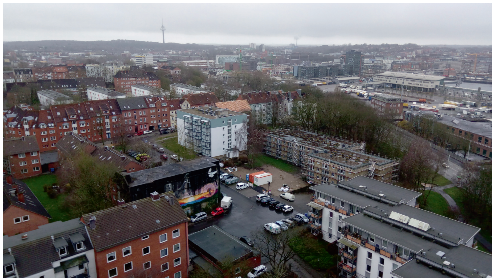
FIGURE 3 View looking south towards the Sandkrug neighborhood (between Sandkrug and Norddeutsche Straße), showing the first completed residential building in the middle of the picture (photo by Sören Weißermel, March 2020)

The retrofitting works in the Sandkrug neighborhood began in 2018 and the first building was finished in autumn 2019. Others followed in a delayed process, taking up to three years. Conversations with current tenants revealed deficiencies in the