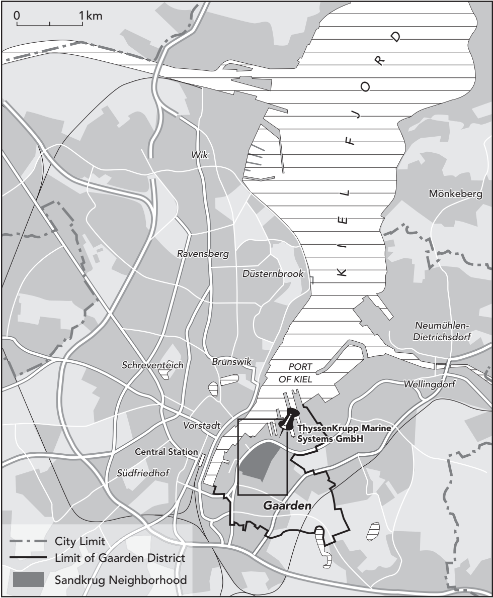
FIGURE 1 The city of Kiel and location of the Gaarden district (map produced by the authors using OpenStreetMap)

purchases, the company now owns almost the entire residential area, which allows holistic redevelopment.