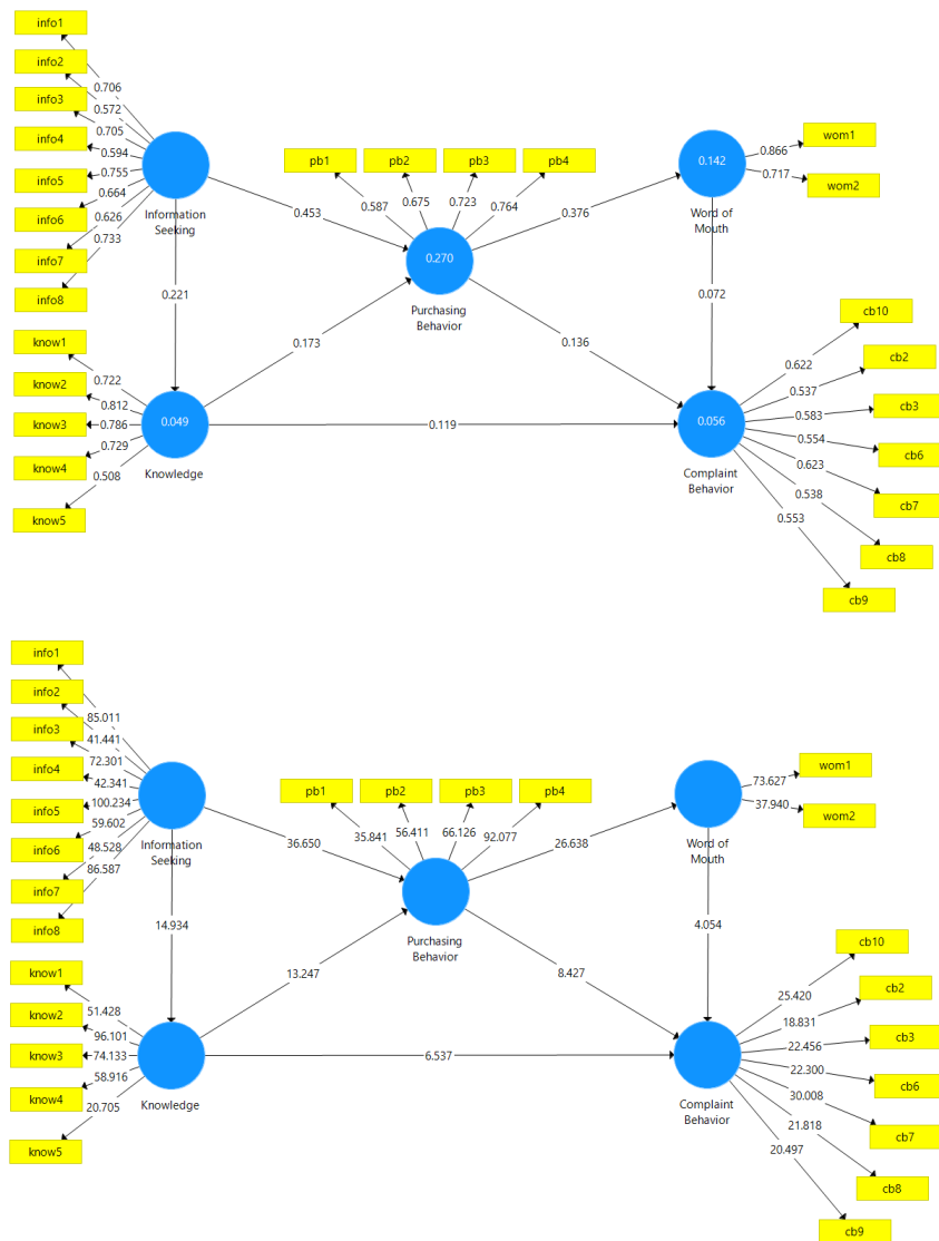
Figure 2. The result of structural equation modelling

the discriminant validity is good. The results in Table 2 show that the AVE values for all variables are greater than 0.5, with values in the range of 0.574 and 0.795.