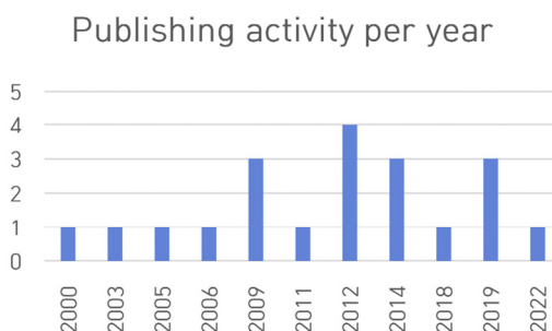
Figure 2. Annual Distribution of the Sampled Studies