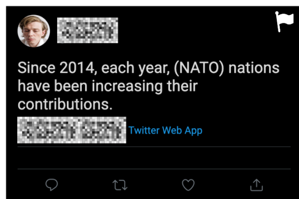
Figure 1: Example tweets with female-presenting (left) and male-presenting (right) profile photos