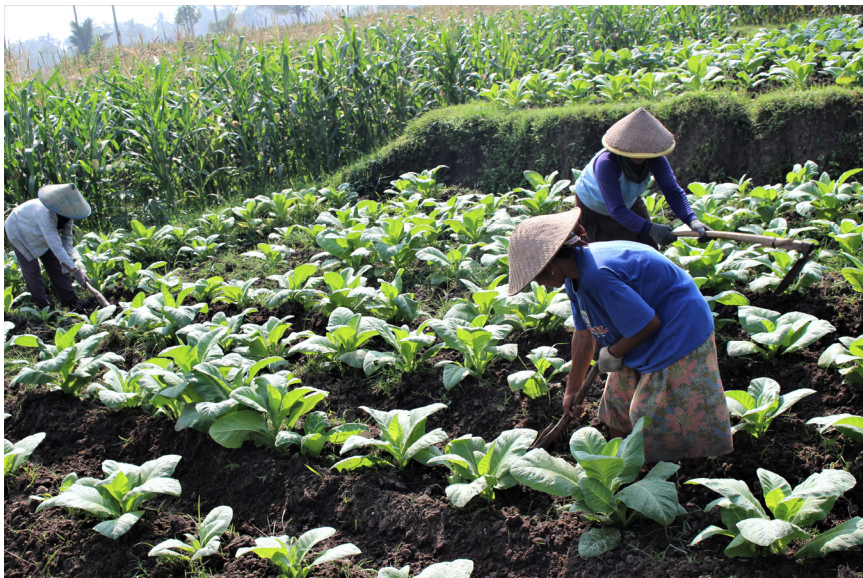
FIGURE 7. Women workers hoeing tobacco in Java.

tobacco farmers, and workers in Lombok all had limited knowledge of legal work hours, benefits, and overtime. Workers were typically paid below minimum wage rates, and steep gender pay disparities meant women were especially underpaid. Women often earn 75 percent of men's wages, although this dipped as low as 64 percent on some farms. 30 The assessment also found fifteen children involved in tobacco labor, including activities considered hazardous (e.g., topping, harvesting, stringing, and loading and unloading the barn). 31