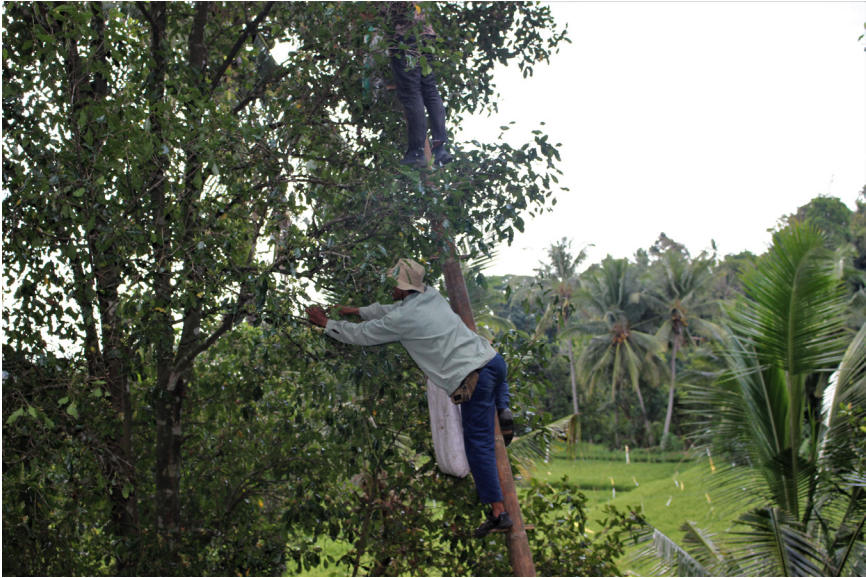
FIGURE 6. A father and son ( above ) pick cloves in Bali.