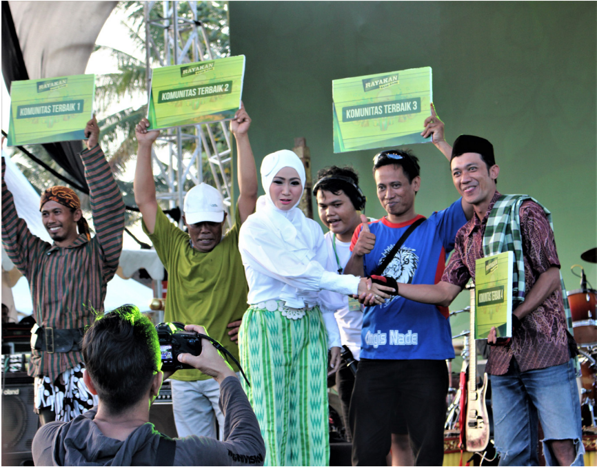
FIGURE 16. Celebrating the four top Sampoerna Hijau brand ambassador communities at a promotional event.

masks, used clothing, cutesy foods and drinks, pomade, and more. Some wrote their Twitter handles and Facebook pages on little prop blackboards. Such DIY production makes stylish and appealing the precarious gig economy and its entrepreneurial imperative of relentless self-promotion and self-branding (Enriquez 2022; Gershon 2018; Ravenelle 2019; Rosenblat 2018).