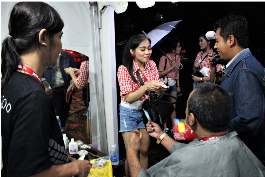
FIGURE 14. A sales promotion girl closes a sale.

Cigarette companies dictate the clothing, hairstyle, and makeup that constitute the SPGs' brand identity. Compared to its competitors, Sampoerna applied more elaborate and stringent rules to the visual spectacle of SPGs' bodies. Sampoerna insisted on natural black rather than dyed hair, disallowed jewelry and accessories, styled them with identical hair and makeup for events, and provided their uniform down to handbags and shoes (Keds, wedges, or heels). Each brand had a dress uniform, typically reserved for night events, and a pants uniform that they mostly wore for daytime rounds. Sometimes, Dia was forced to cram her size-40 feet into painfully small and tight shoes. Male team leaders are allowed to smoke, but SPGs in uniform must not be seen smoking and are supposed to cover their uniform with jackets when eating. Their beautiful bodies were not supposed to be caught in acts of consumption (or excretion, for that matter). At events, we caught glimpses of SPGs furtively eating in cars and smoking while queuing up for public toilets, where we overheard one ask a colleague if she feared the impact of her smoking on her children.