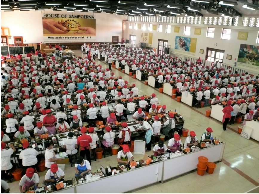
FIGURE 3. The House of Sampoerna's living factory exhibit in 2007. The large billboard evokes patrilineal transmission of the brand.

capitalism's increased foreign ownership, mechanized production methods, and marketing tactics. As this book tracks the trajectory of kretek from tobacco and clove seeds to smoke and ash, it brings into focus the labor Sampoerna requires across different stages of the commodity's life and its methods of enrolling this labor.