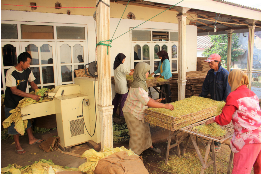
FIGURE 5. A farmer feeds tobacco into a cutting machine while workers prepare it for sun-curing.

taking flashlights with them to fish in the middle of the day, pretending they had gone crazy so their creditors wouldn't try to collect. They didn't dare go home at night because they were sixty million rupiah in debt. If you always did well with tobacco, then houses around here would be three stories high. There are cases, though, of four or five family members in one house going on the hajj.