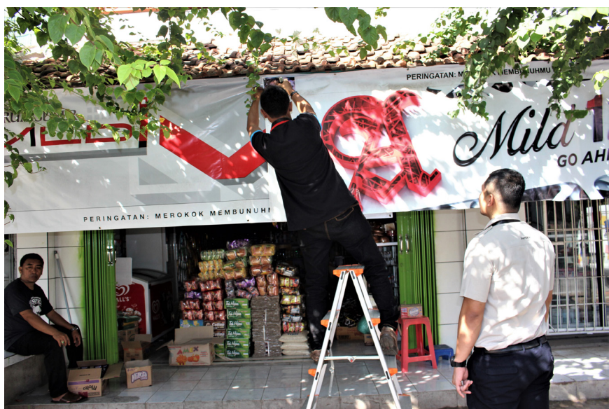
FIGURE 20. Stapling a Sampoerna ad on top of competitor Djarum's ad.