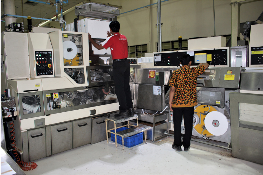
FIGURE 11. Filter machine production technician and daily worker.

a technical-skills hierarchy that rises from operators to production technician or “prodtech,” maintenance mechanics and electricians, up to those with supervisory responsibilities such as team leaders and managers. Whereas monthly workers enjoyed access to cafeterias with extensive buffets and foosball tables to encourage interactive play, daily workers either brought food from home or purchased it from a limited canteen. This had the effect of reinforcing hierarchies; one daily worker, who described eating as a basic matter of refueling, was teased by colleagues for his monotonous diet of canteen meatball soup ( bakso ). Uniforms further underscored distinctions between workers, with Sampoerna hiring tailors to customize beige and batik uniforms for monthly workers and issuing daily workers polo shirts and black slacks in standard sizes.