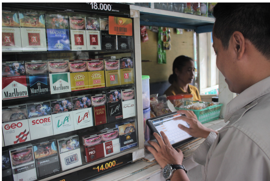
FIGURE 18. A cigarette seller enters data in his iPad while visiting a roadside vendor.

Sellers incessantly administer questionnaires to retailers and feed harvested information into centralized knowledge systems via data tracking software loaded on their iPads. From retailers, Sampoerna learns about company and competitor brand performance, customer identities (age, gender, occupation, class), shopping patterns, retailer hours, busy and slack times of day and night, and so on. The goal is to achieve an exquisite attunement to the market, which includes a wealth of informal and contested spaces and sidewalk activities that are nevertheless amenable to being tracked and rendered legible (Anjaria 2016; Harms 2016). At the same time, the sellers do not presume that retailers are fully trustworthy sources of information. Jamal told me retailers routinely try to curry favor with sellers by exaggerating Sampoerna's product performance. Sampoerna always crosschecks its data against intelligence purchased from marketing firm Nielsen. Sellers also use iPads to self-report, proving that they have visited sites on their routes with time-stamped photographs of barcoded company cards affixed to display cases.