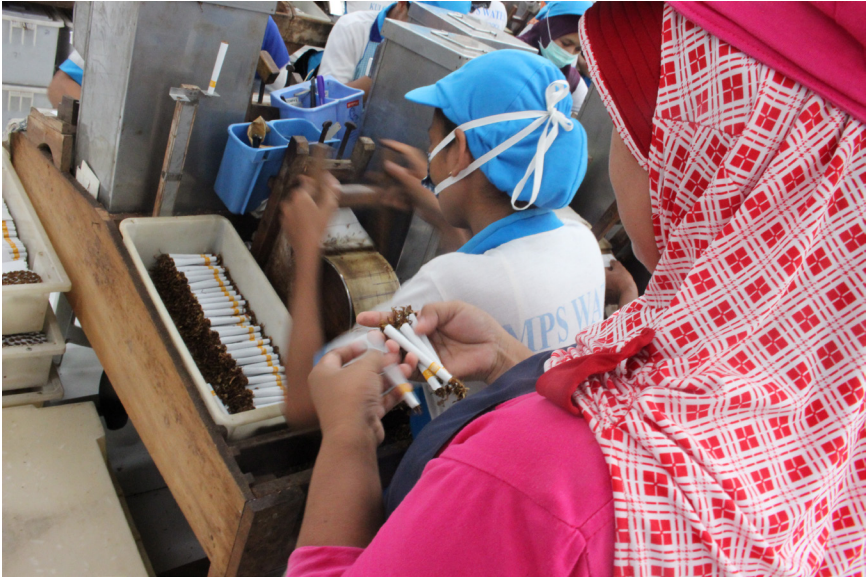
FIGURE 10. A supervisor inspects a roller's kretek.