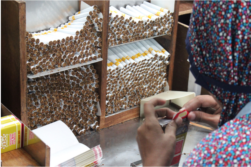
FIGURE 8. Packing kretek.

and gluing corners before placing the finished pack in a wooden container. As she taught me these actions, Titin repeatedly compared the work of packing cigarettes to wrapping a present ( kado ), a comparison made strange by the gift wrap's graphic warnings that smoking kills smokers, harms children, and leads to cancered lips, throats, and lungs. 7 As my skill improved, I learned to engage my left pinky and ring finger to tap cigarettes into place and to work quickly and cleanly with glue so that it would not coat my fingers or stray parts of the pack, leading to sticky, dirty surfaces. My neighbors made as many as 150 packs an hour, while I managed 43 an hour after a week. Once they have five slof (one hundred packs, or one pasok ), packers walk these over to a storage rack for excise tax labeling. They otherwise have little relief from their seated positions on the stools. Quotas, and pay, are adjusted to match worker capacity. My neighbors produced 1,150 to 1,200 packs over an eight-hour day, or 900 to 1,000 packs over a seven-hour day.