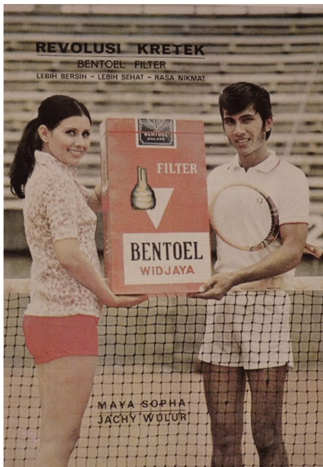
FIGURE 1. In this vintage ad in the Bentoel Museum, the company markets new machine-rolled kretek with filters to the middle and upper class as a “revolution” advancing cleanliness, health, and pleasure.

machine-rolled kretek brands often employ puffed or expanded tobacco made from leaves that are saturated with freon and ammonia gases and then freeze-dried, doubling in size and enabling the manufacture of cigarettes with smoke that is supposedly lower in tar. 29