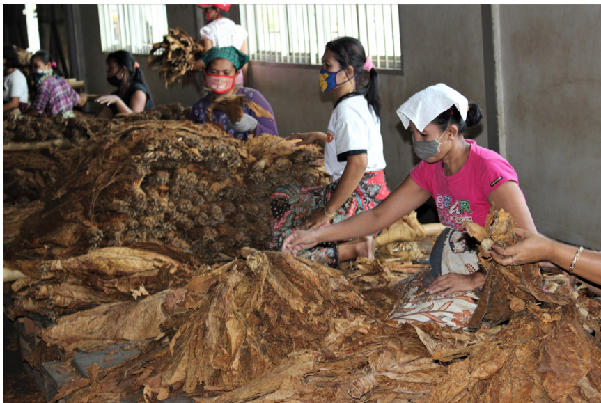
FIGURE 4. Workers wearing masks to protect against dust sort tobacco leaves in a Jember warehouse.

are refusing lower-quality leaves. As they work their way down the rows, workers make bundles for transport to the farmer's home by foot, car, or motorbike.