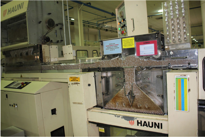
FIGURE 12. Cigarette maker.

largely self-operating and self-checking are troubled by the procedures, problems, and layered human oversight actually involved in keeping machines running, but this perspective is nevertheless suggestive of how such mechanized factory atmospheres can deemphasize the collective human labor involved.