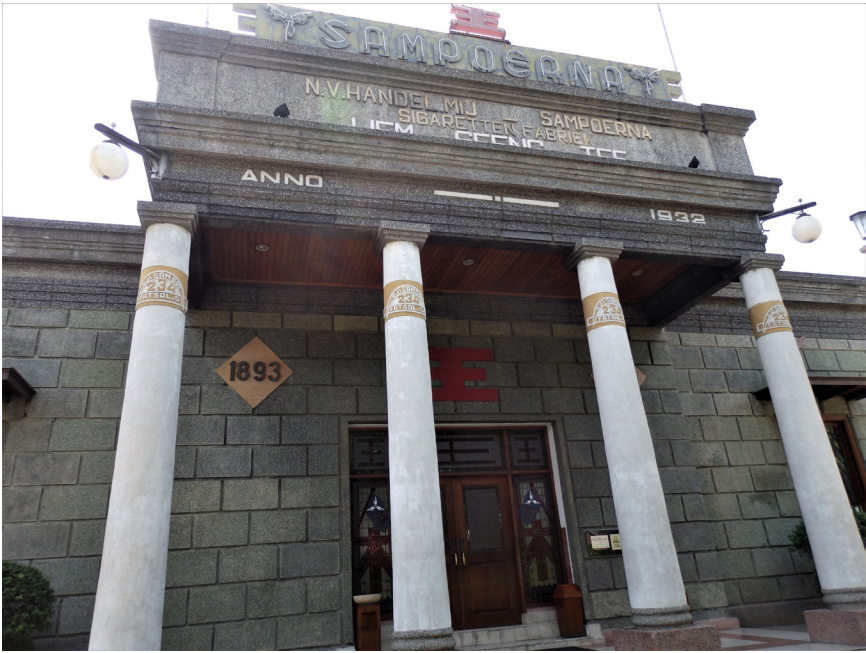
FIGURE 2. The House of Sampoerna museum with columns resembling the Dji Sam Soe krek .

nation-building and displaying pride in museums, films, artwork, and literature. Claims of national heritage represent another global tobacco industry commonplace. The industry has deployed cultural pride and heritage discourses and yoked wartime patriotism to tobacco production and cigarette provisioning in soldiers' rations, in countries ranging from China to Bulgaria, Canada, France, and Egypt (Brandt 2007; Klein 1993; Kohrman 2018; Neuburger 2013; Proctor 2011; Rudy 2005; Russell 2019; Shechter 2006). Tobacco boosterism in the United States downplays how production was rooted in slavery and remains mired in racial inequalities today (Benson 2012; Griffith 2009; Kingsolver 2011; Milov 2019; Swanson 2014).