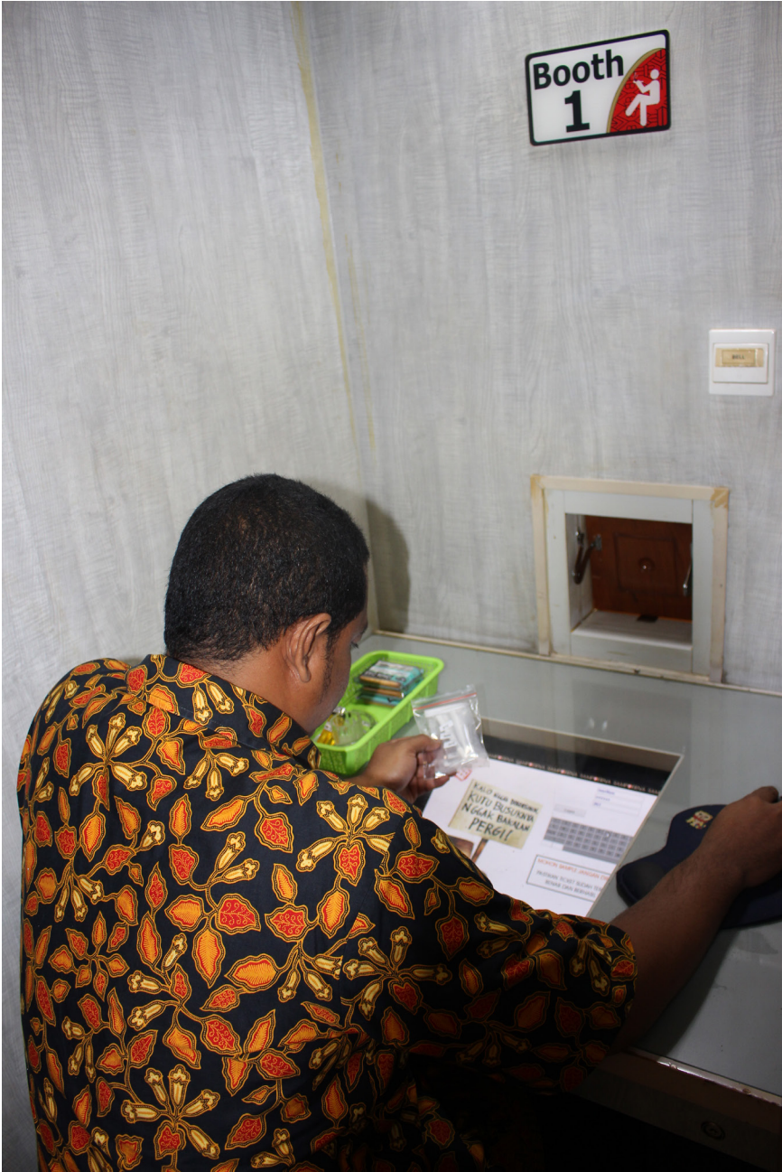
FIGURE 13. Smoking panel volunteer.