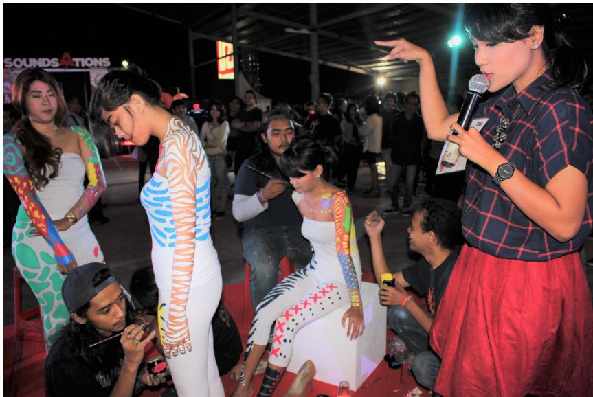
FIGURE 17. An MC calls attention to artists body-painting models at a promotional event.

Sampoerna marketing staff's ambivalence toward us was rooted in concern that we might publish a damning account of their work or report on their performance to Sampoerna's head office or perhaps in awareness that our presence, like their own, made these events less cool and harmed rather than benefited the brand. Whatever it was—perhaps some combination of these concerns—they seemed to find little upside in our presence. Sometimes it seemed to me that they were trying too hard to project that they were having a good time with their intricate cool handshakes and laughter. On the second night at Averland, one confessed that he felt like he was getting a cold, would rather be home with his family, and had no desire whatsoever to be there. When his boss had asked him to attend, however, the obligatory response was yes. If feigning fun and enthusiasm formed a sometimes burdensome chore, at least he was rewarded with a regular paycheck, unlike influencers whose fluctuating and intermittent contracts hinged on their popularity and likes.