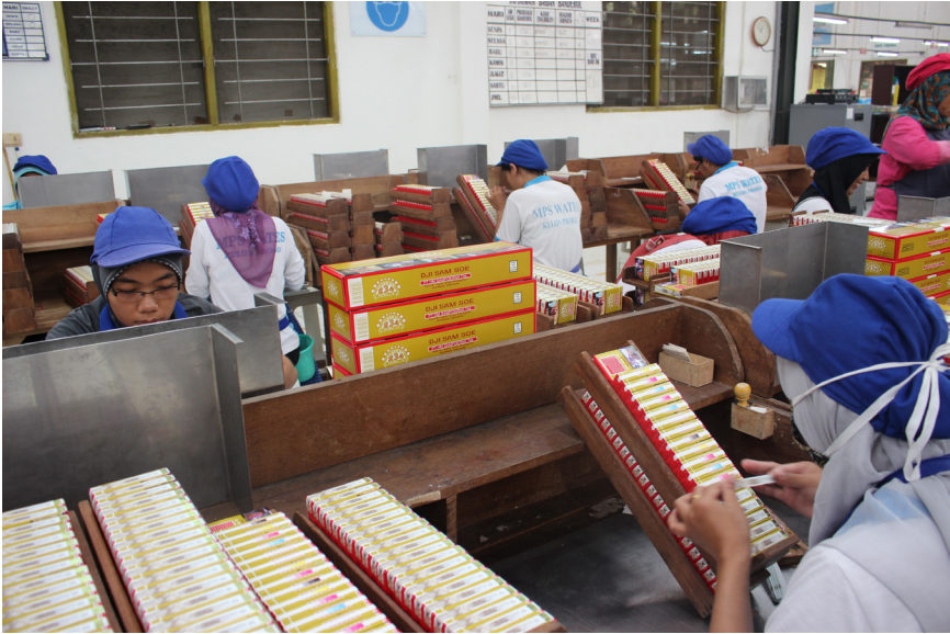
FIGURE 9. Applying excise tax stamps.

fingers, they lost sensation and dexterity. I was inclined to rub my fingers together to peel off the glue, but Bu Wahyu discouraged this, insisting that I wipe my hands on a rag instead. After labeling a couple hundred packs, labelers tuck them into cartons, grabbing five with each hand and placing them at the ends of the carton at the same time, then fitting five more with each hand into the middle. While filling cartons, I learned to keep my glue-coated index fingers poised aloft while my drier fingers performed the work.