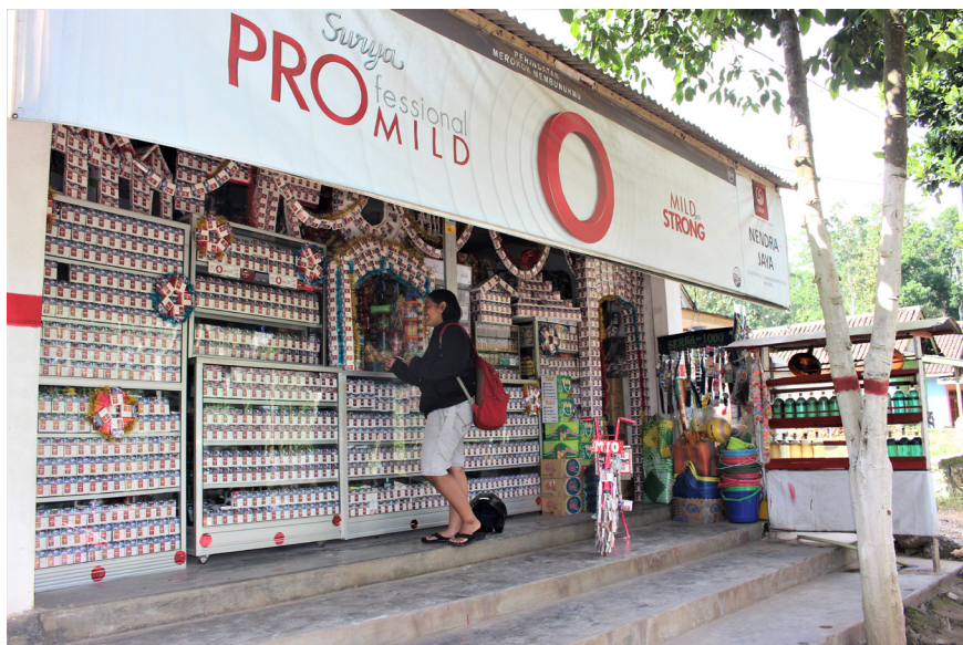
FIGURE 19. A rural shop owner's dedicated participation in Gudang Garam's Surya display competition won her a Yamaha Mio motorbike. She decorated her shop with over a thousand cigarette packs and fashioned a model of her anticipated motorbike prize out of packs.