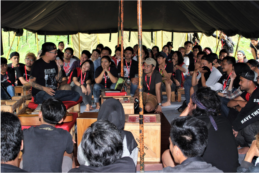
FIGURE 15. A rock star dispensing marketing advice to aspiring musicians.

alternative. The Sex Pistols: punk rock, anti-establishment. Morrissey: a dandy.” As he listed these musicians, Arifin refrained from passing judgement on them, opting instead to present their distinct identities as equal and neutral insertion points for capitalism (similarly, see Banks 2022 on corporate sponsorship of Black musical genres).