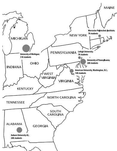
Map 4.3 Participating universities from East Coast