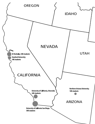
Map 4.2 Participating universities from West Coast