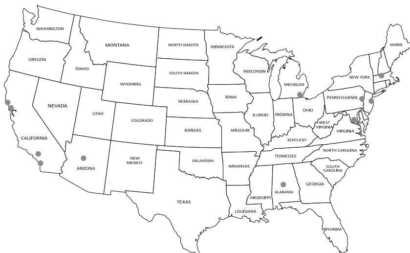
Map 4.1 Participating universities from the United States